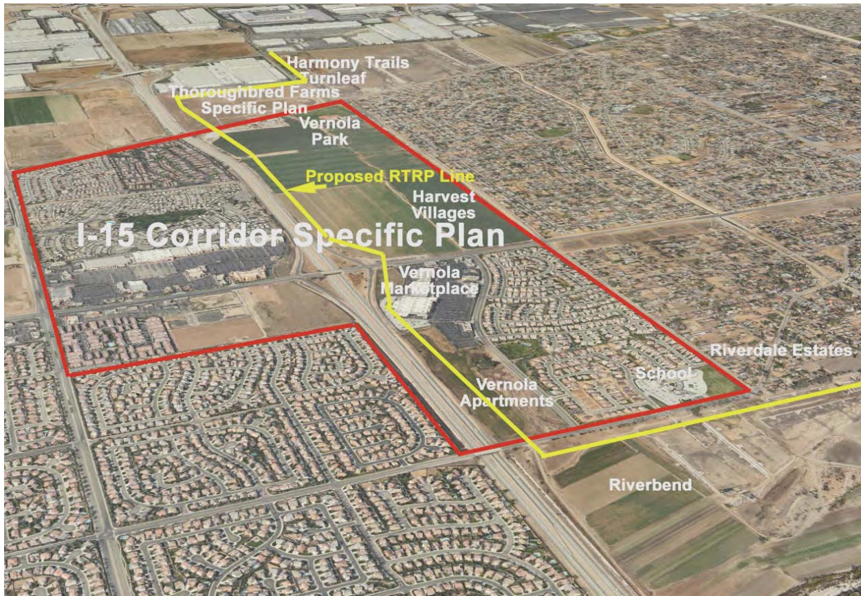
EXHIBIT B. PERSPECTIVE VIEW OF I-15 SPECIFIC PLAN AND RTRP'S PATH

The 200 acres in Planning Areas 10 through 13, 15, 20 and 21 on the east side of the I-15 and north of Limonite Avenue are entitled for approximately 500 residential units (single-family and multi-family), commercial, and industrial uses. Studies are now under way for the design and development of these planning areas