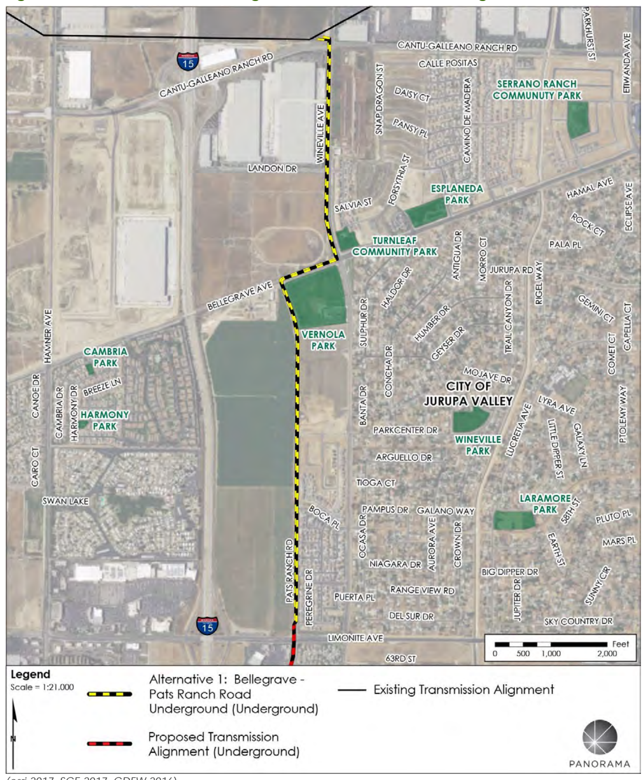
Figure 3.5-1 Alternative 1: Bellegrave - Pats Ranch Road Underground