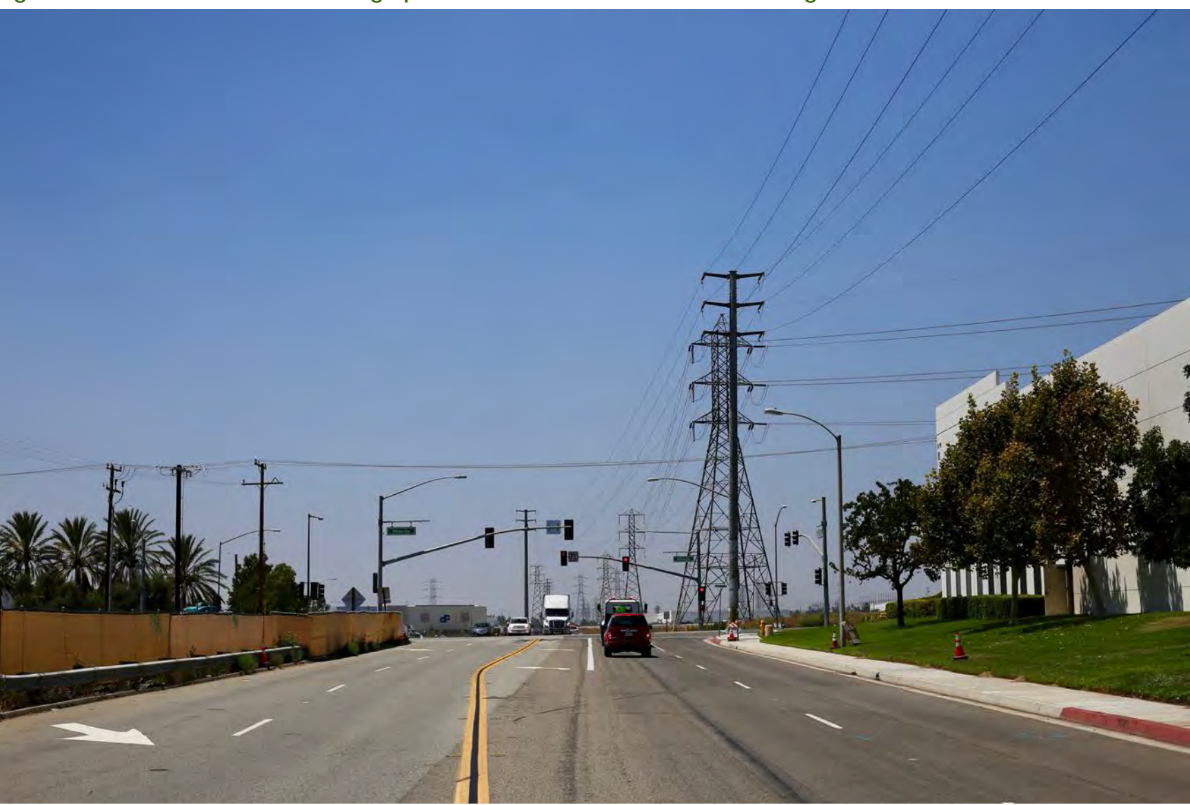
Figure 4.1-4 KOP 1 - Baseline Photograph - Cantu-Galleano Ranch Road Looking West