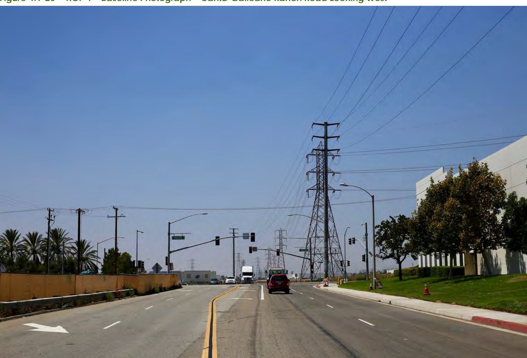
Figure 4.1-20 KOP 1 - Baseline Photograph - Cantu-Galleano Ranch Road Looking West