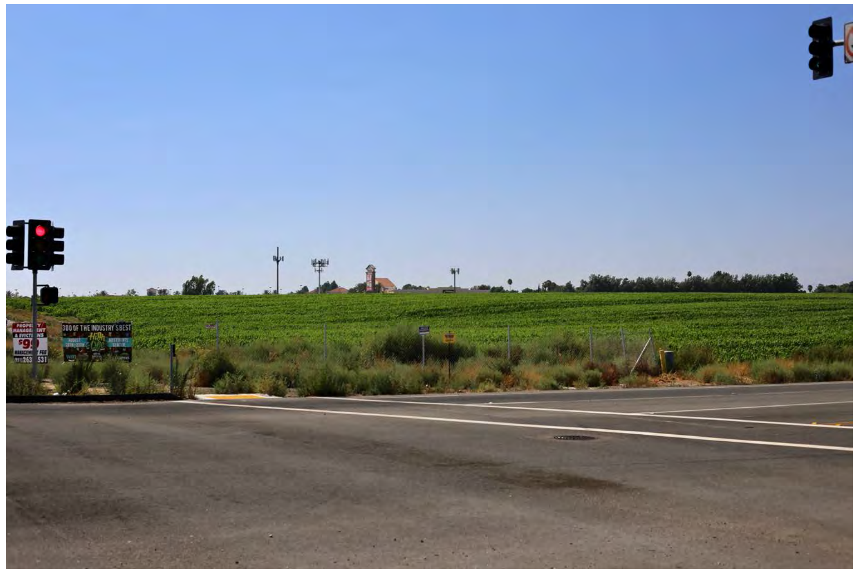
Figure 4.1-14 KOP 6 - Baseline Photograph - Limonite Avenue at Pats Ranch Road Looking Northwest