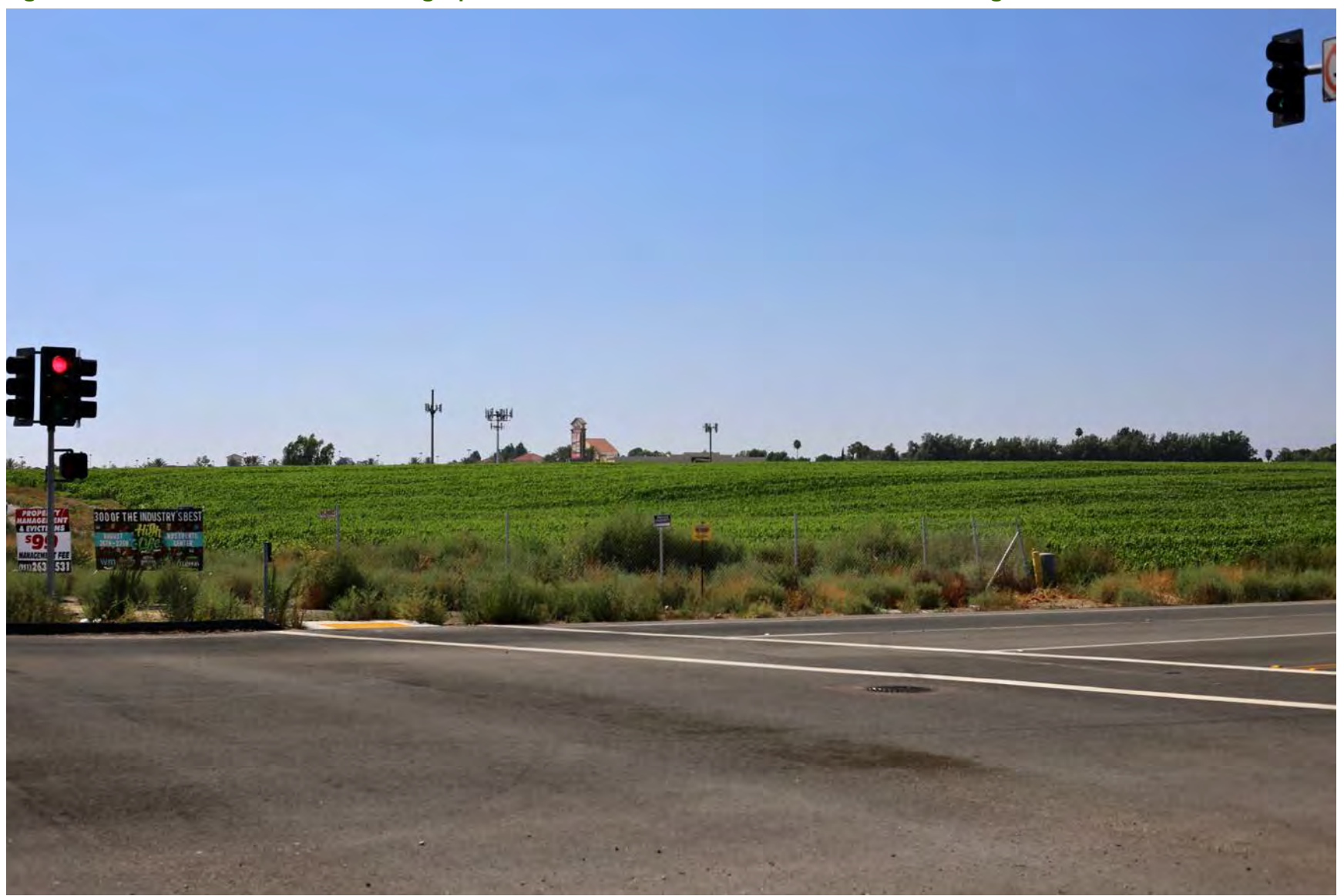
Figure 4.1-26 KOP 6 - Baseline Photograph - Limonite Avenue at Pats Ranch Road Looking Northwest