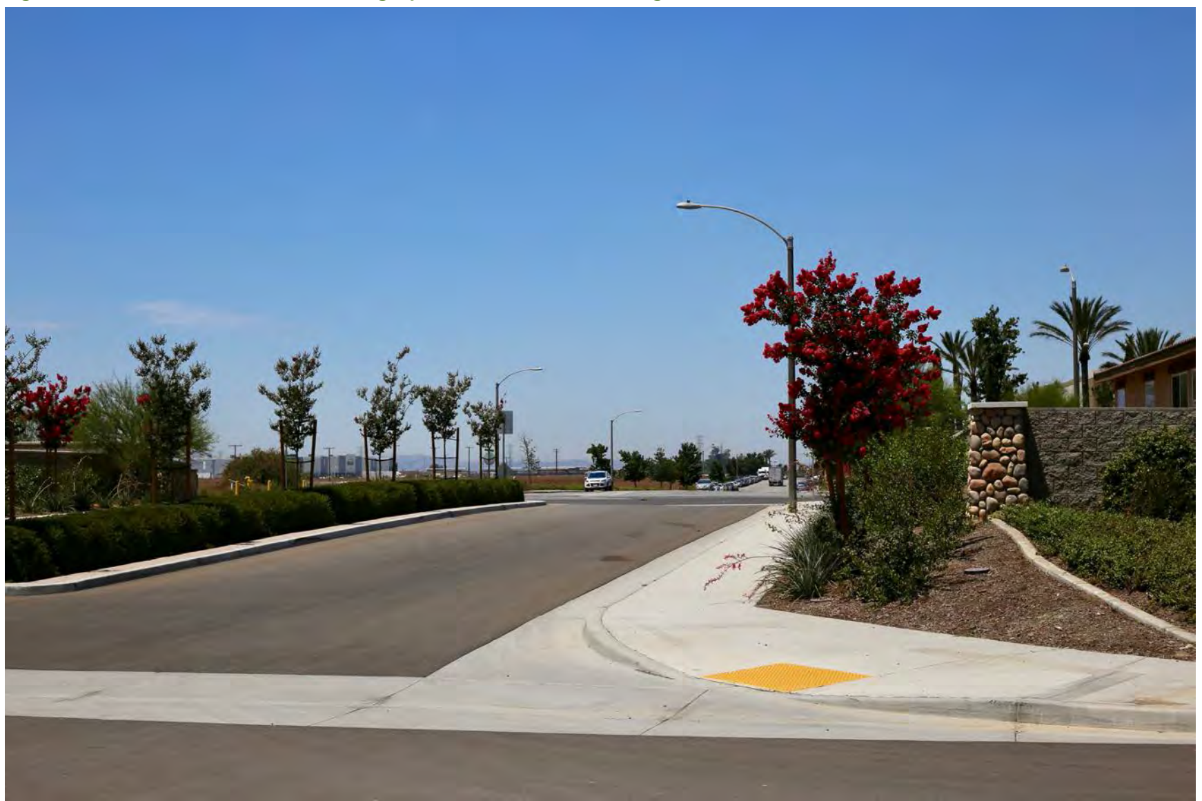
Figure 4.1-28 KOP 3 – Baseline Photograph – Vernola Park Looking Southwest