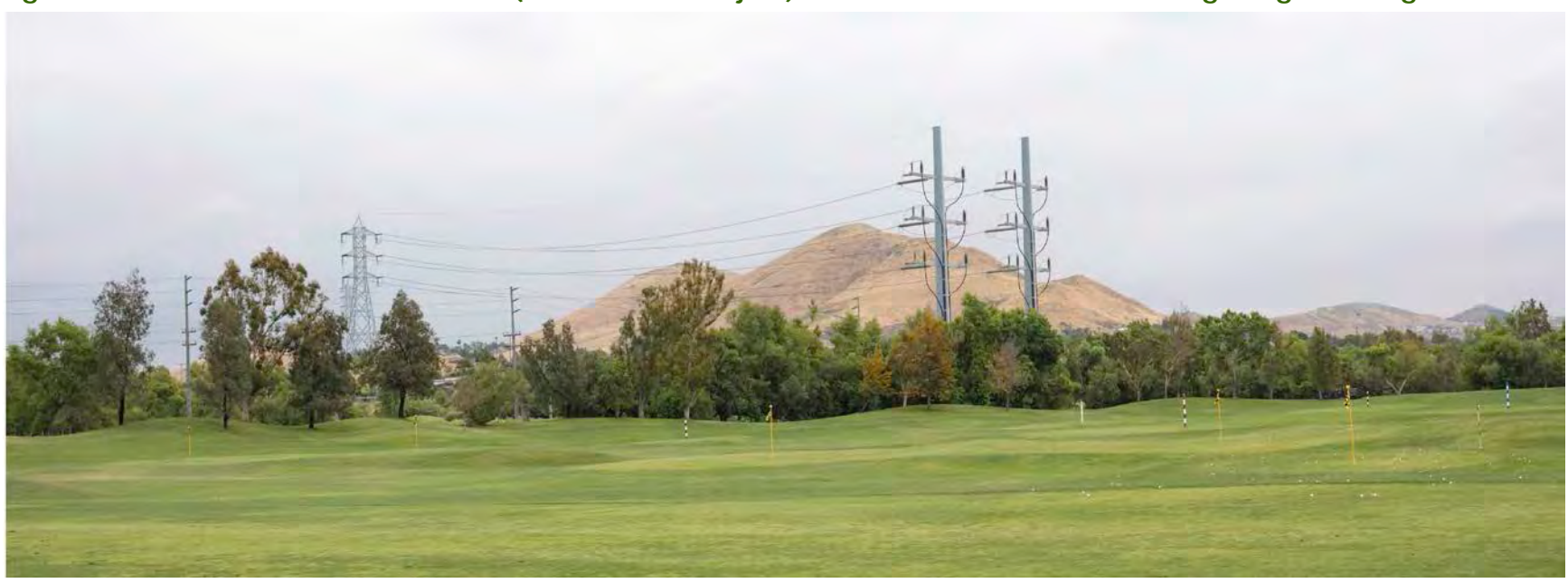
Figure 4.1-17 KOP 7 – Photosimulation (After Revised Project) – Goose Creek Golf Club Driving Range Looking Southeast<sup>2</sup>