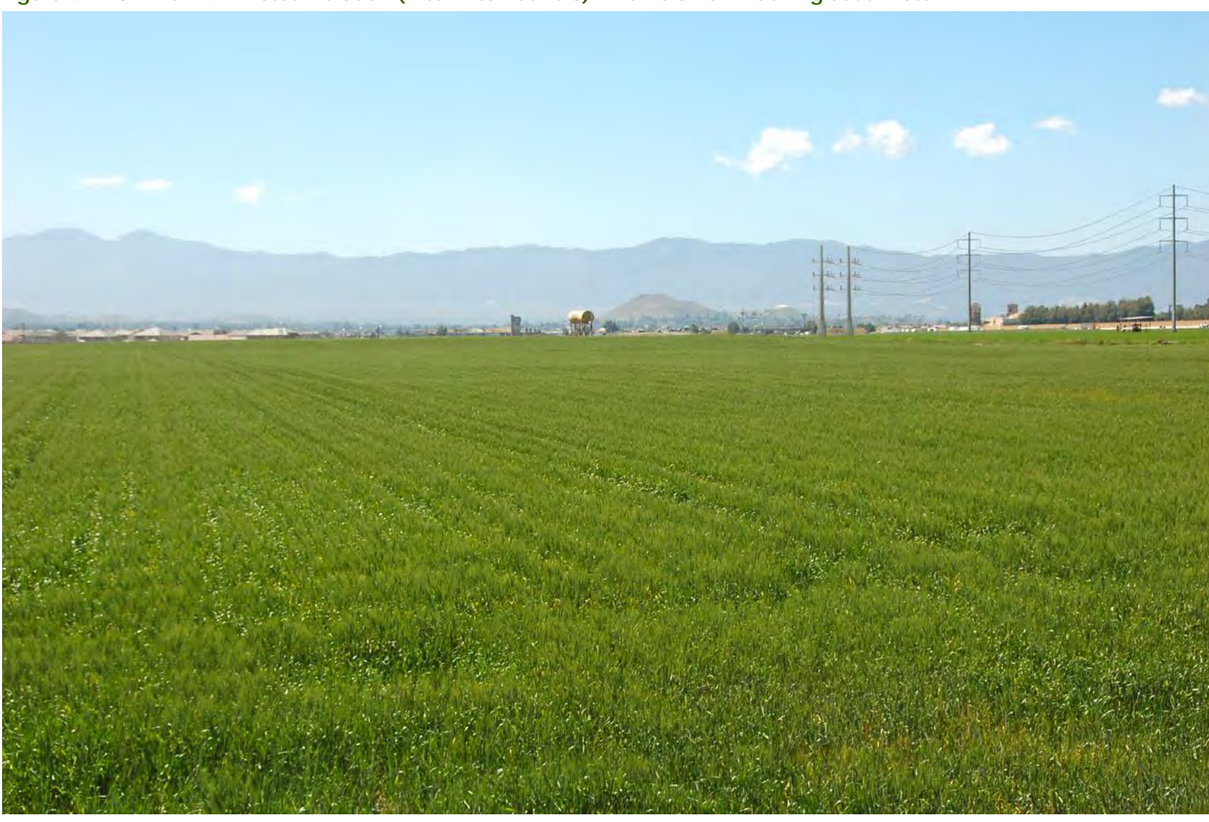
Figure 4.1-23 KOP 4 – Photosimulation (After Alternative 3) – Vernola Park Looking Southwest