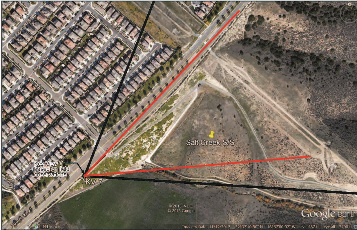
Exhibit 1 - This graphic shows the locations of the GPS supplied coordinates for Key View 7 and the location of the view from investigations on the site visit. The 2 black lines are the horizontal field of view shown in the SDG&E supplied baseline conditions and the visual simulations. The 2 red lines are the industry standard 40° view cone which would be captured using a 50mm focal length equivalent camera lens. Exhibits 2 and 3 graphically demonstrate the dichotomy that exists between the 2 approaches.