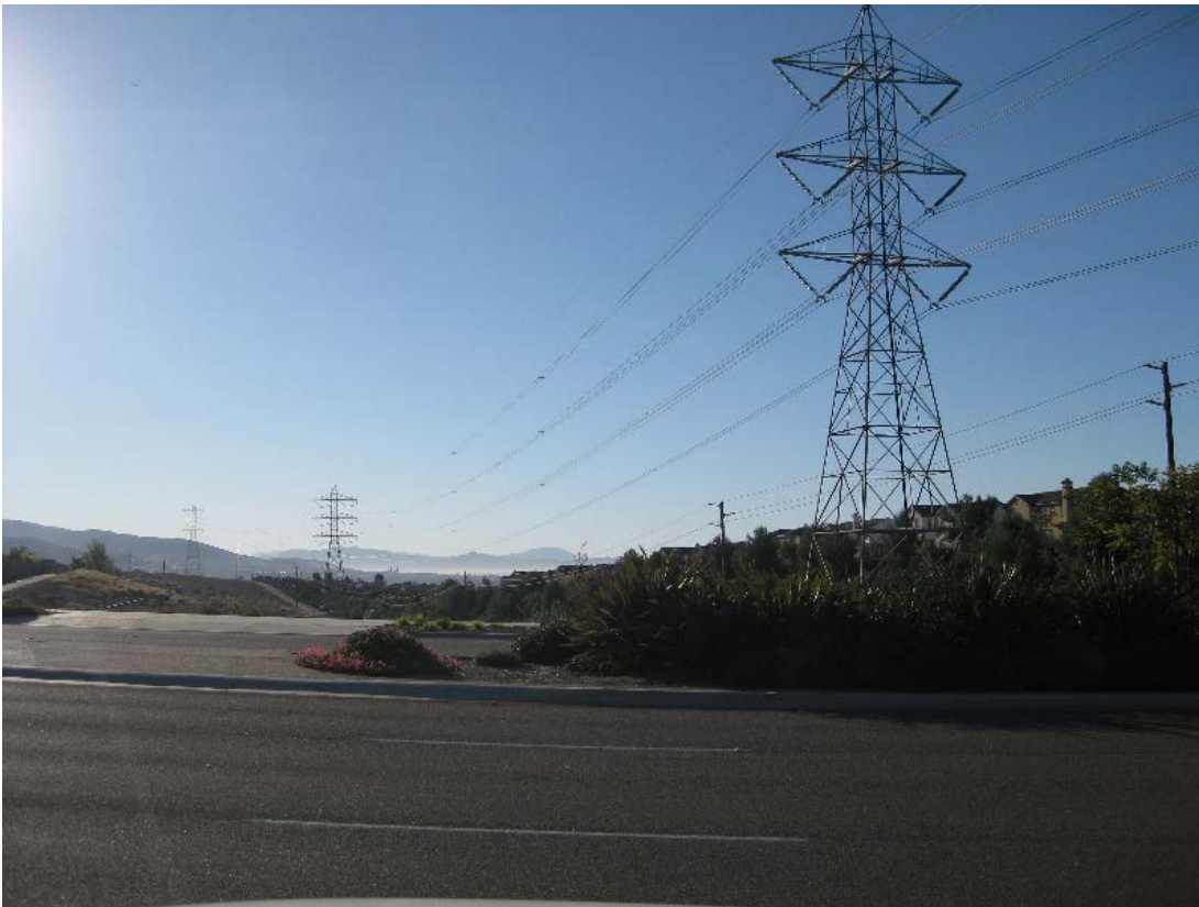
Original Key View 4 Field Photograph - Looking South (In this photo, project features would include power poles and lines). The consultant determined that the dark quality and blurry details of this image did not provide as much information as the subsequent image ultimately used in the PEA.