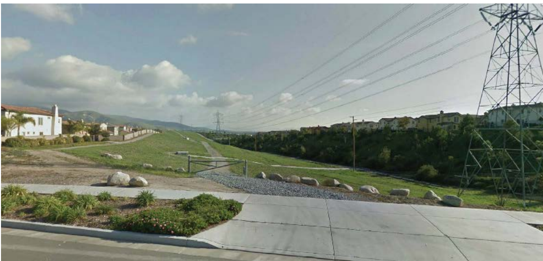
Final Key View 4 Google Image - Looking South (before cropping to 50 mm size) (In this photo, project features would include power poles and lines)