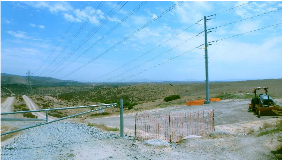
Original Key View 9 Field Photograph - Looking South (note construction equipment)

At the time the Key View 9 field photograph was taken, construction equipment was present on-site and in the foreground of the image, as shown below.