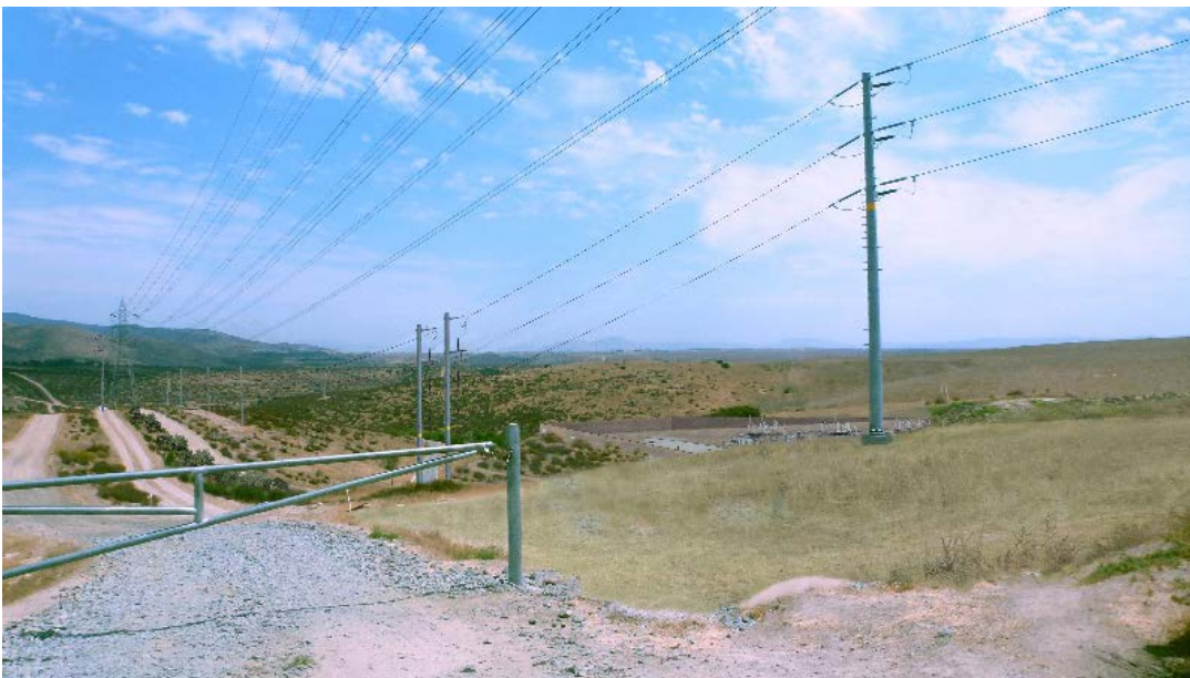
Final Key View 9 Existing Field Photograph - Looking South (before cropping to 50 mm size) (Construction equipment has been removed)

The existing view was modified to remove the construction equipment so that the change in the project could be viewed more clearly, without the visual clutter associated with the temporary presence of construction equipment. Below is the modified final existing photo showing the existing view with vegetation.