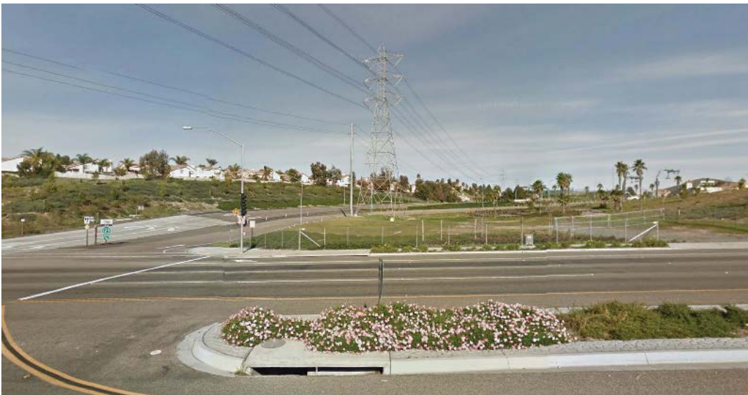
Final Key View 2