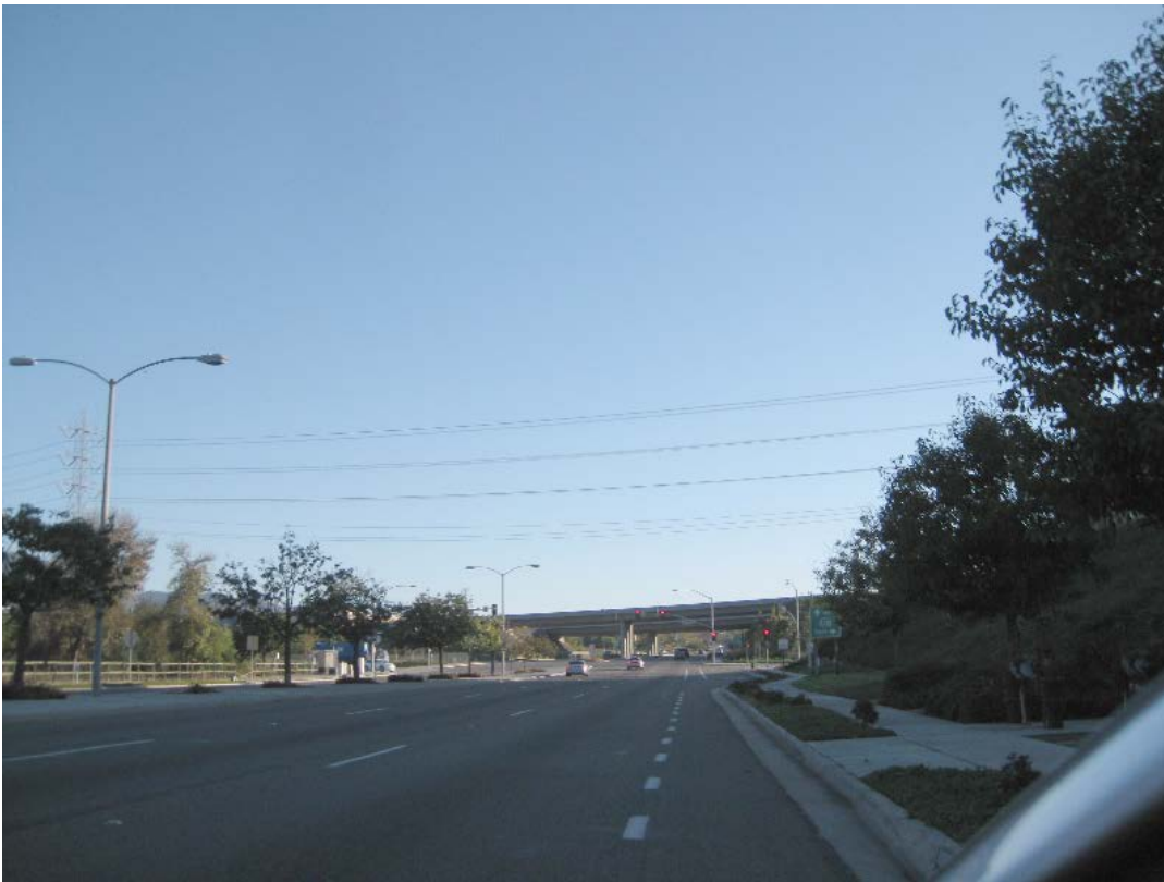
Original Key View 2 Field Photograph - Looking East (In this photo, project features would include power lines across the road, and would not include the proposed pole north of the road). The consultant determined that the orientation, dark quality, and blurry details of this image did not provide as much information as the subsequent image ultimately used in the PEA.