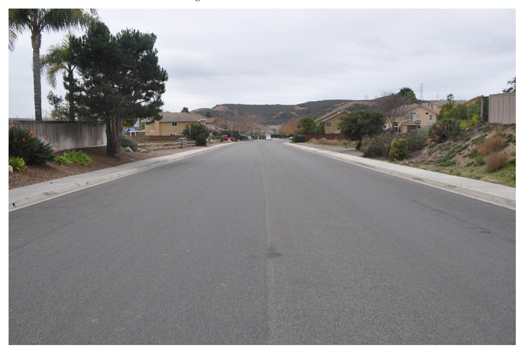
View of Park Village Road between Mannix Road and Celome Lane