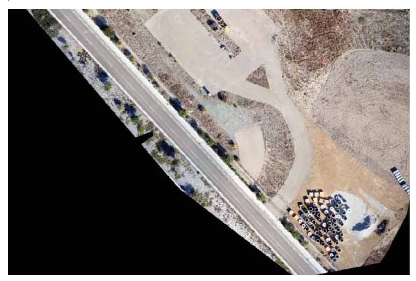
Carmel Valley Staging Yard Aerial Photo taken 11/22/2016

The entrance is located off of Camino Del Sur and most of the yard has been captured in this aerial photo: