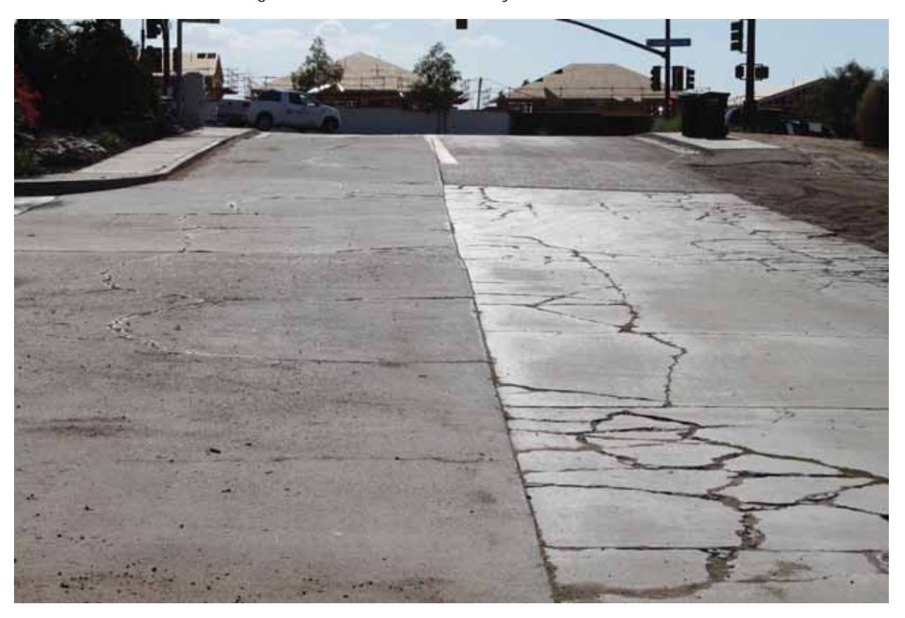
Evergreen Nursery Staging Yard Photo taken 11/22/2016

Via Abertuna is shown looking south towards Carmel Valley Road.