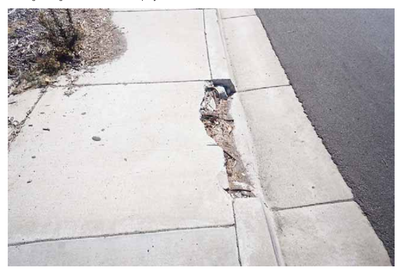
Driving Range Yard Photo taken 11/17/2016

Existing damaged concrete north of project entrance.