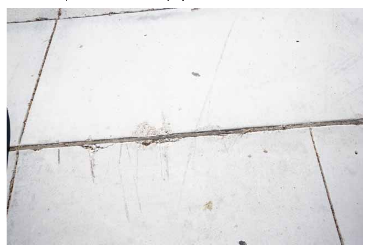
Shire Yard - Photo taken 11/17/2016

Scratches and chips to concrete at entrance way to yard.