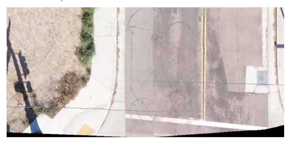
Evergreen Nursery Staging Yard Aerial Photo taken 11/17/2016

The entrance to the Evergreen Nursery Staging Yard appears to be at the intersection of Carmel Valley Road and Via Abertuna Drive. This photo shows the entrance on Via Abertuna Drive. Cracking and scratches to the asphalt and the concrete are visible.