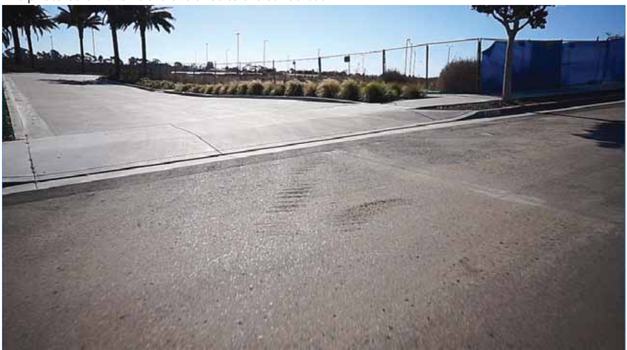
Alternative Shire Yard Photo taken 11/22/2016

The photo below shows the entrance to the cul-du-sac.