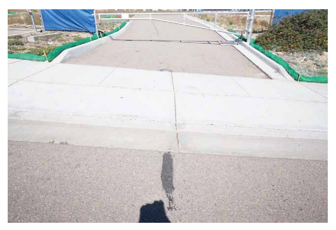
Shire Yard - Photo taken 11/17/2016

Existing asphalt is scarred and chips exist on the concrete drive entrance. Scratches also exist in the concrete on the drive-way entrance and the asphalt in the roadway. Cracking observed in the concrete gutter and cracking in existing asphalt roadway.