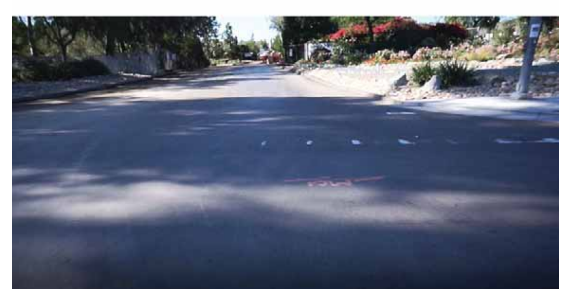
Vulcan Mine Yard Photo taken 11/22/2016

The entrance to sites 1A & 1B is well maintained asphalt and does not show signs of any existing damage.