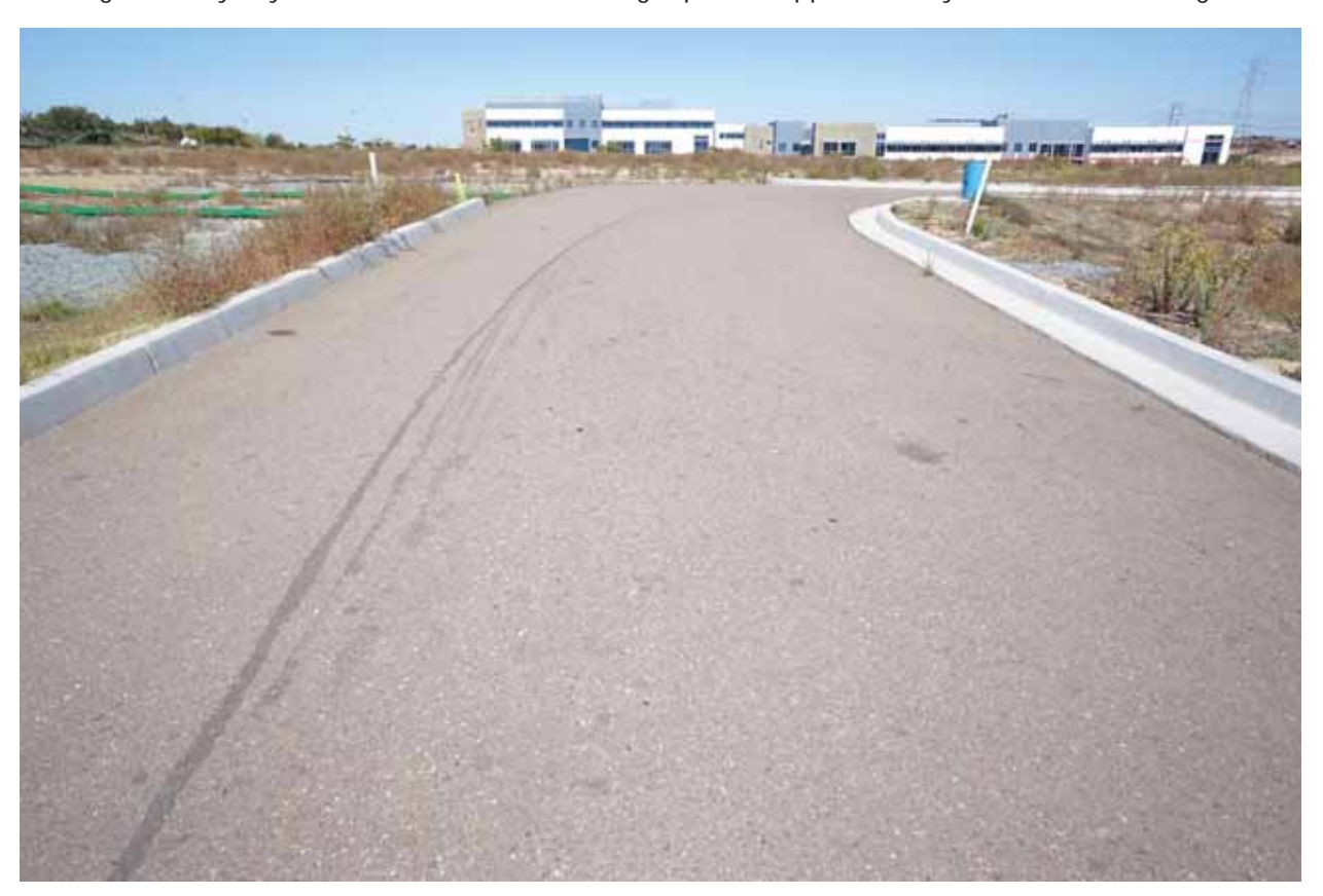
Shire Yard - Photo taken 11/17/2016

Existing driveway beyond the entrance, the existing asphalt is approximately 1 ½" from finished grade.