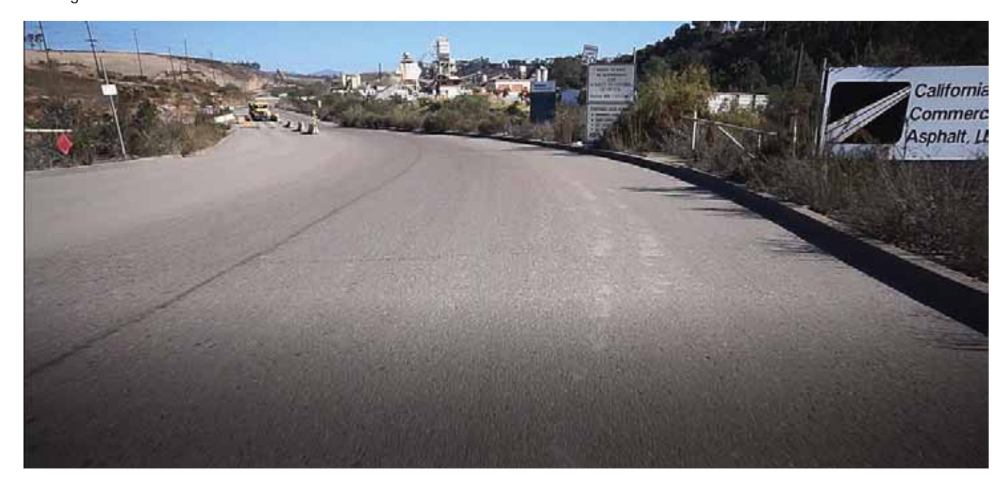
Vulcan Mine Yard Photo taken 11/22/2016

The entrance point to site 3 would need to be developed. The photo shows the anticipated entrance point to this yard. The asphalt here is well maintained and does not show much signs of wear or damage.