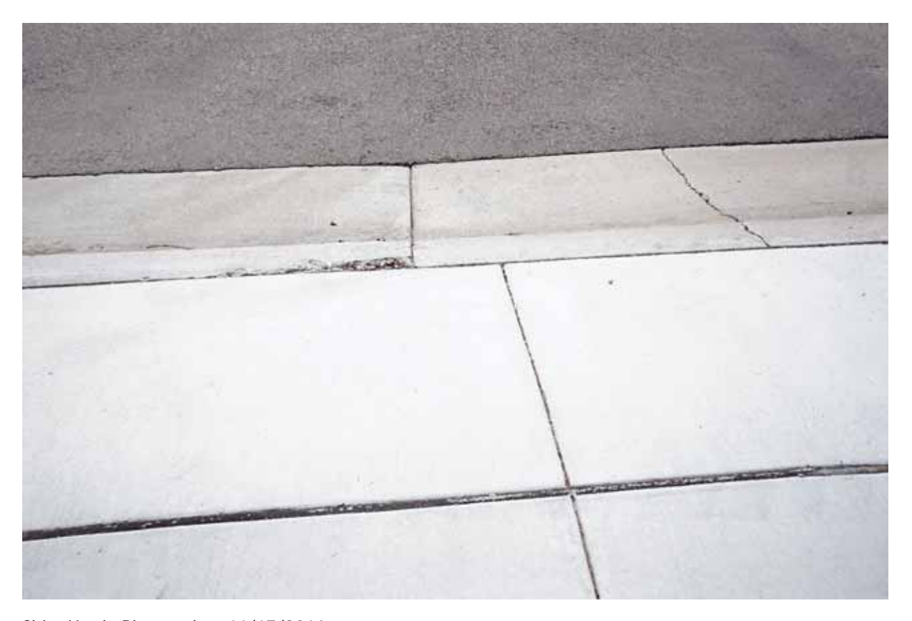
Shire Yard - Photo taken 11/17/2016