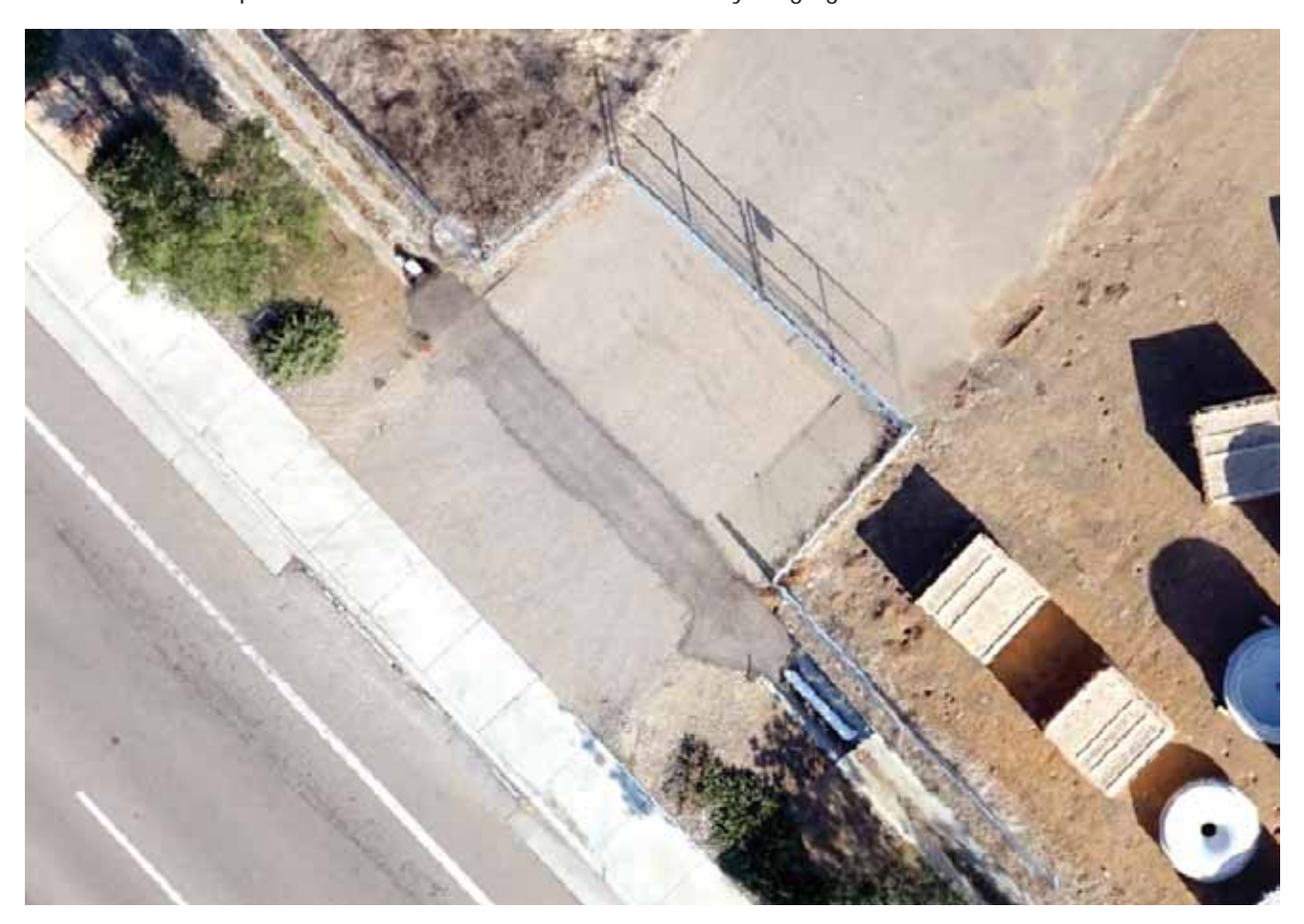
Carmel Valley Staging Yard Aerial Photo taken 11/17/2016

Considerable amounts of damage, cracking and scratching to both the concrete and the asphalt can be seen in this aerial photo of the entrance to the Carmel Valley Staging Yard.