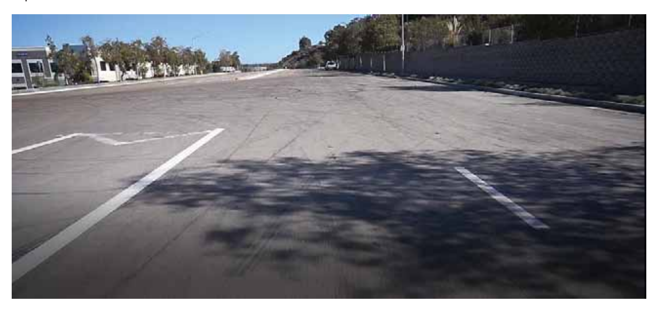
Vulcan Mine Yard Photo taken 11/22/2016

The entrance point to site 2 (shown looking directly east) has minor scratching and cracking to the asphalt.