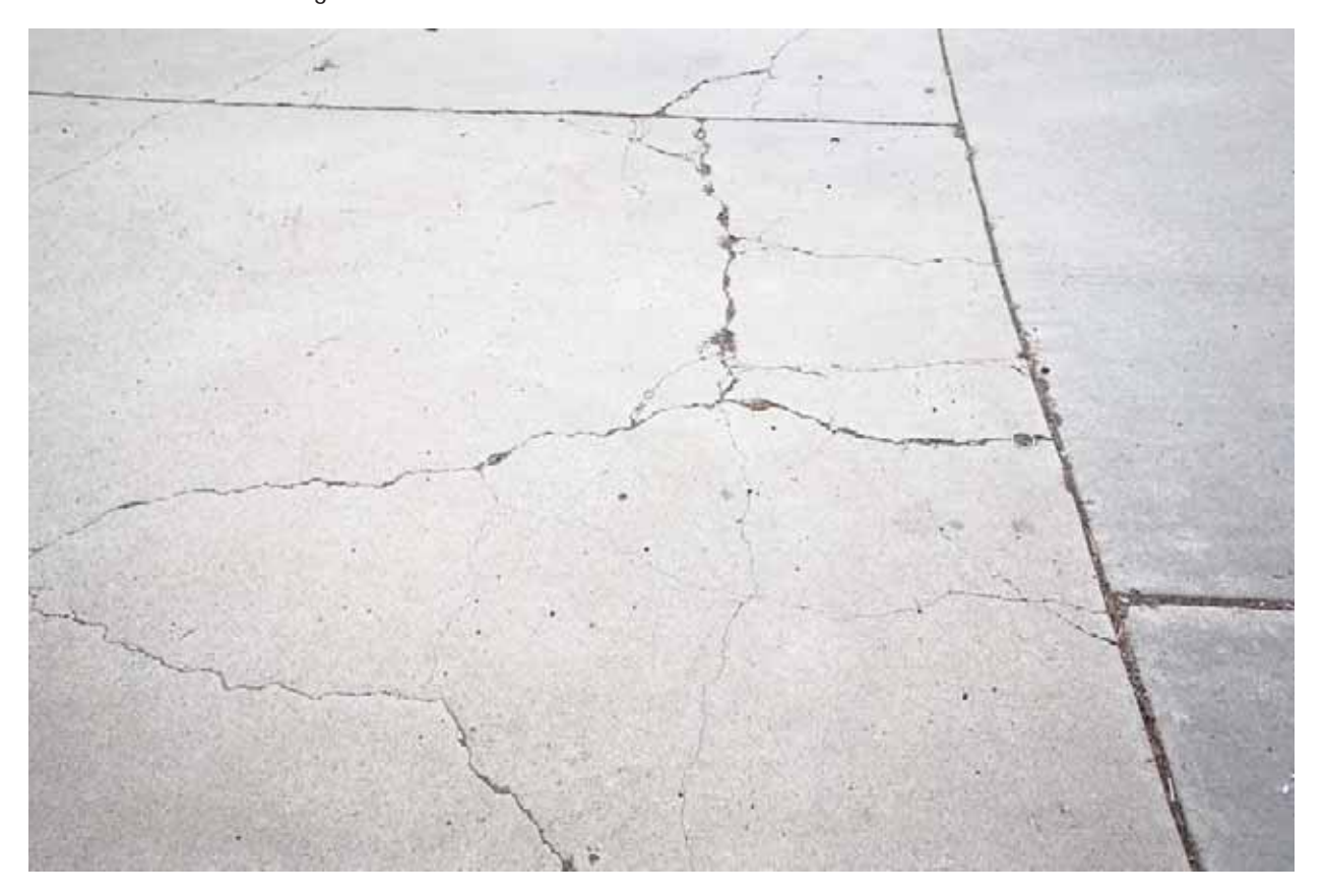
Driving Range Yard Photo taken 11/17/2016