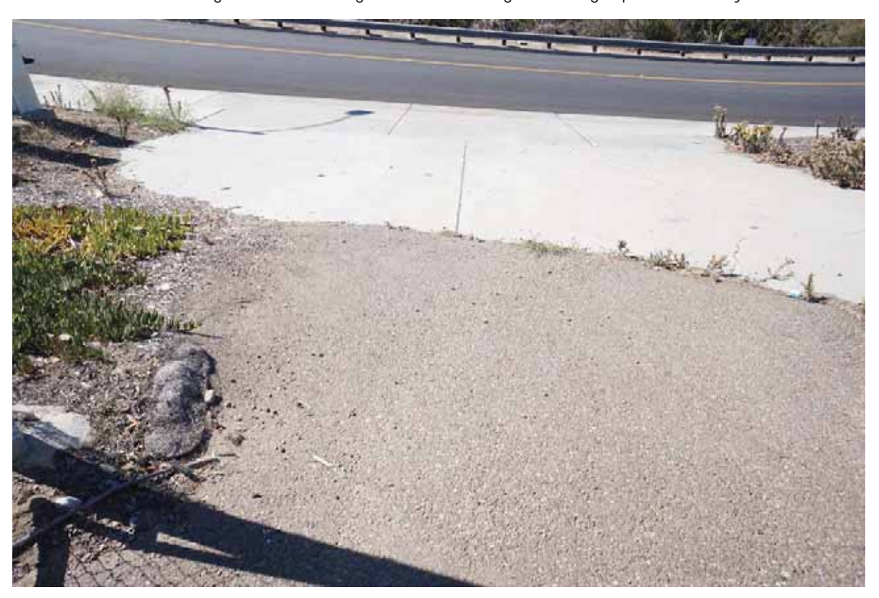
Driving Range Yard Photo taken 11/17/2016

Extensive cracking of concrete drive approach. Existing asphalt is in deteriorated condition throughout the entire drive. Cracking in the concrete gutter and cracking in existing asphalt road way.