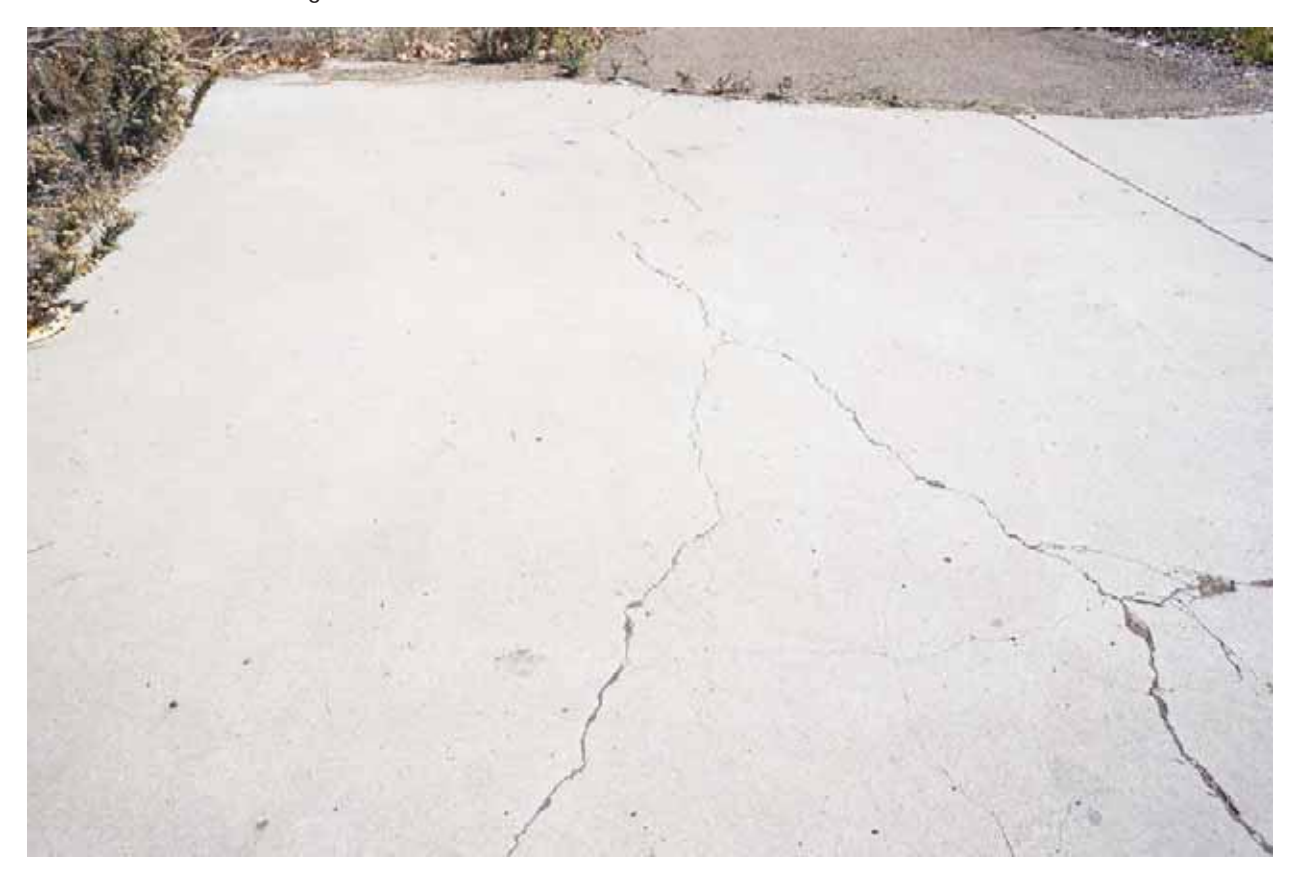
Driving Range Yard Photo taken 11/17/2016