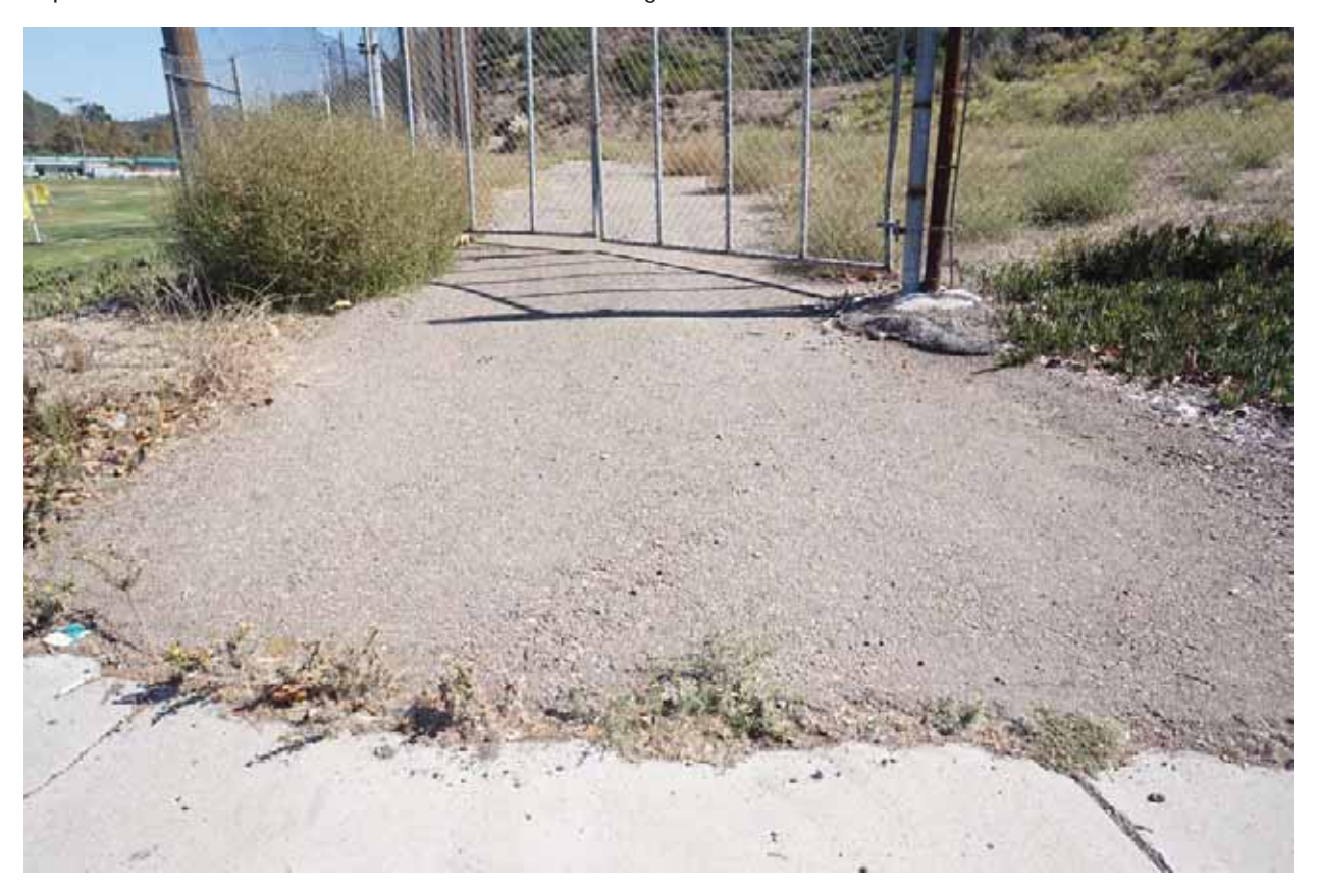
Driving Range Yard Photo taken 11/17/2016

Asphalt is deteriorated and concrete shows cracking.