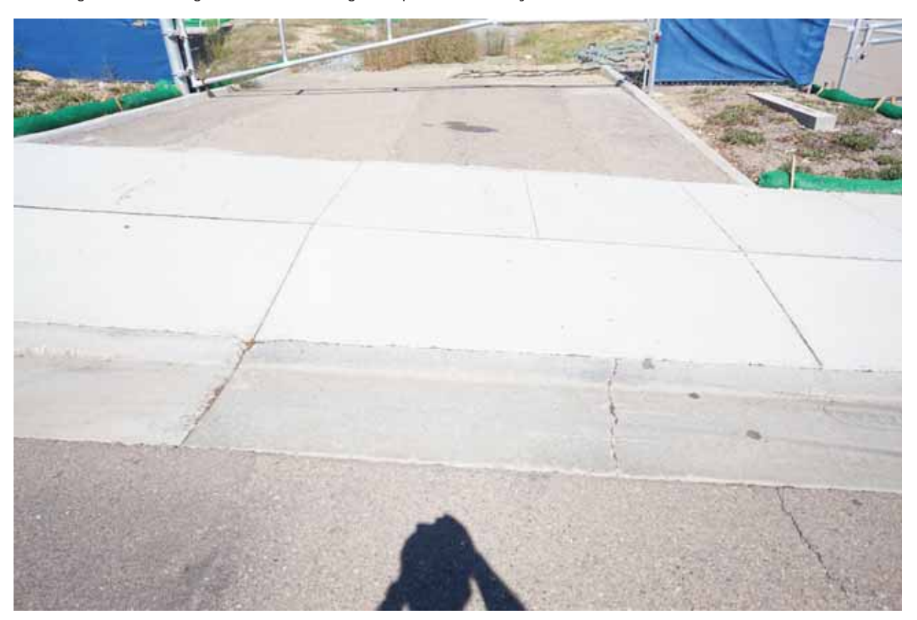
Shire Yard - Photo taken 11/17/2016

Cracking of curb and gutter and cracking of asphalt road way.