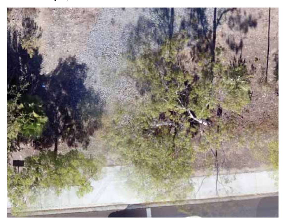
Stowe Staging Yard Aerial Photo taken 11/17/2016

The photo shows the anticipated entrance point to this yard on the south-side of the yard off of Stowe Drive. Driveway improvements would be needed to accommodate access to the site.