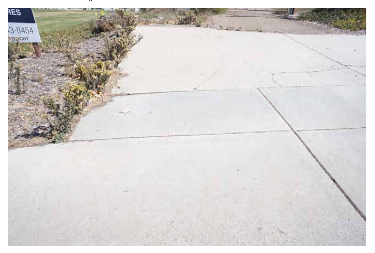
Driving Range Yard Photo taken 11/17/2016