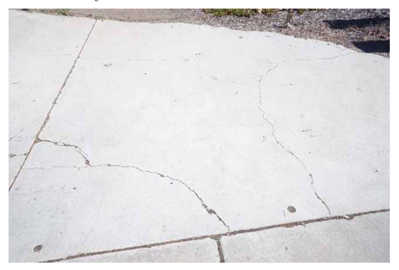
Driving Range Yard Photo taken 11/17/2016