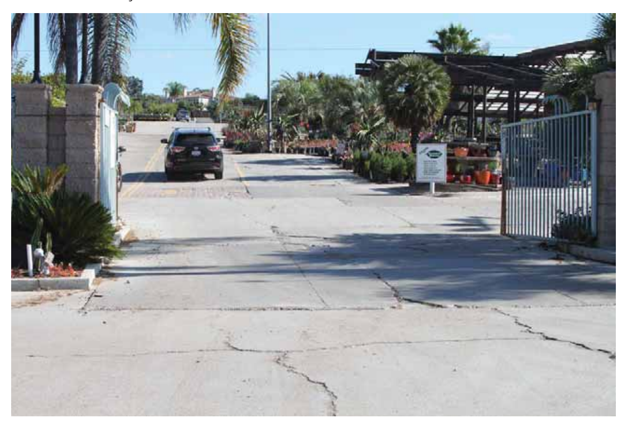
Evergreen Nursery Staging Yard Photo taken 11/22/2016

The entrance to the yard east off of Via Abertuna is shown here.