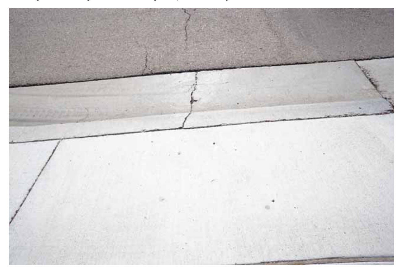
Shire Yard - Photo taken 11/17/2016

Cracking of curb and gutter and cracking of asphalt roadway.