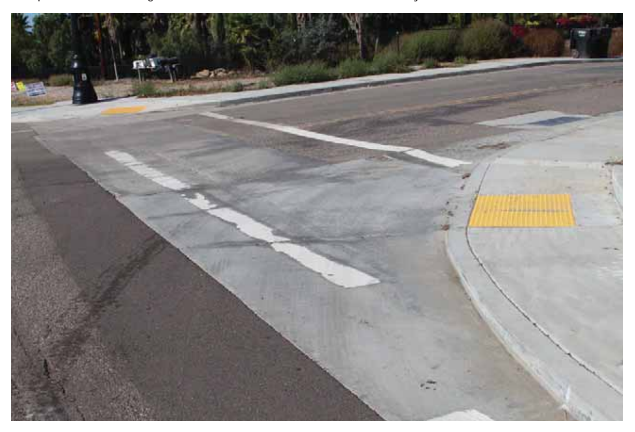
Evergreen Nursery Staging Yard Photo taken 11/22/2016

This photo shows the right turn onto Via Abertuna from Carmel Valley Road.