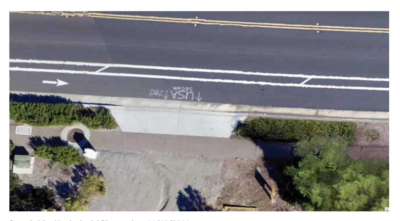
Stonebridge Yard - Aerial Photo taken 11/10/2016

This aerial photo shows the entrance to the Stonebridge Staging Yard. No noticeable cracking or damage to concrete visible on entrances to the yard. Some scratches are visible.