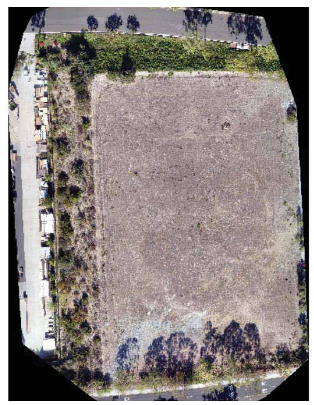
Stowe Staging Yard Aerial Photo taken 11/17/2016

The extent of the Stowe Staging Yard is captured in this aerial photo.