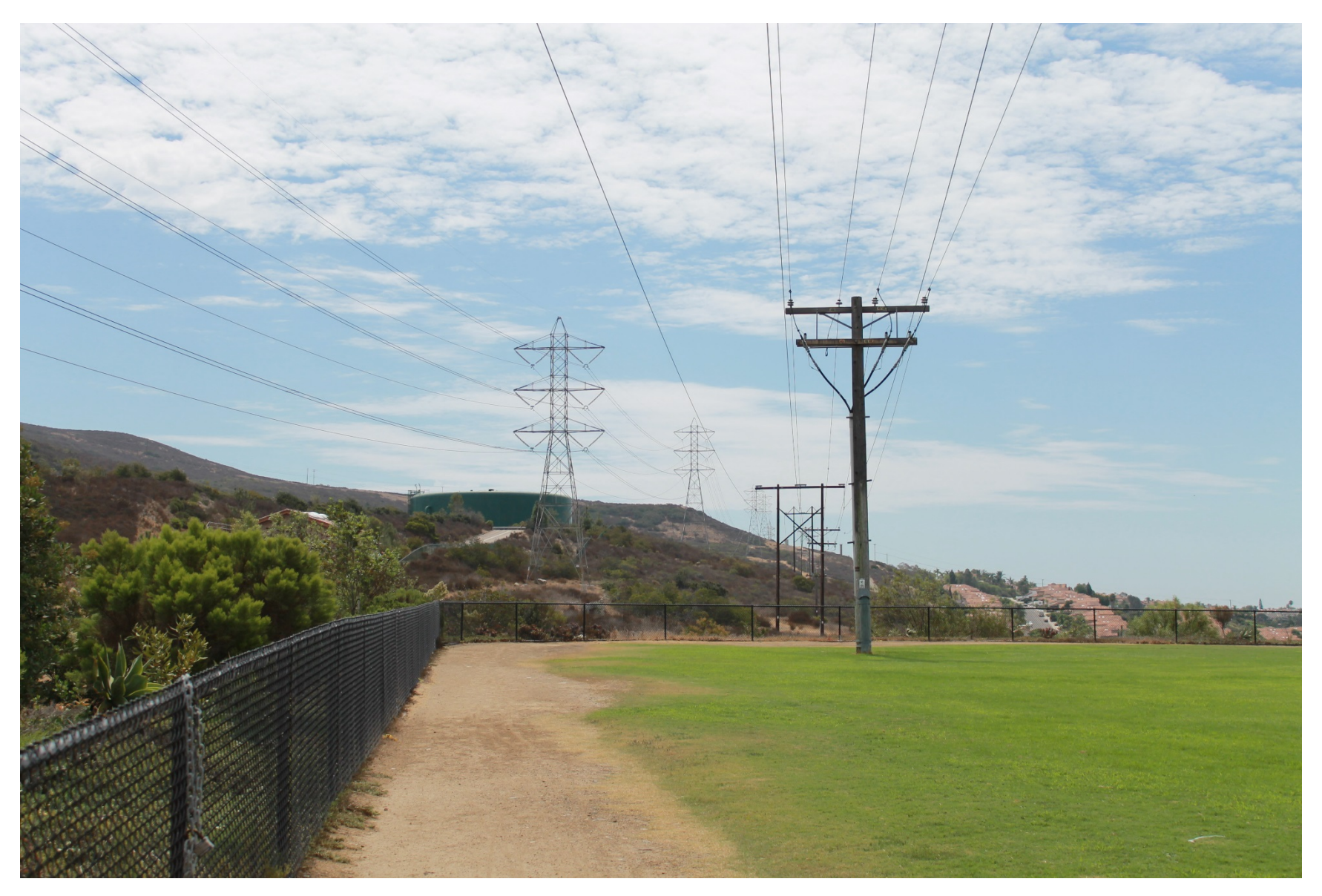
Note the structure shown is a cable pole \,