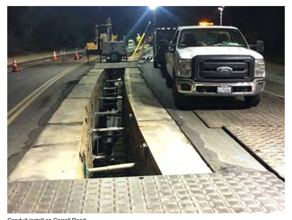
Conduit install on Carroll Road.

Photo Attributes Capture Date/Time: Thu Aug 10 2017 22:19:23 GMT-0700 (PDT) Coordinates: 32.891783, -117.184980 View Direction: South