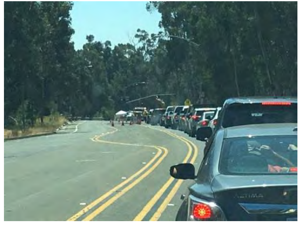
on Traffic stop east of Semillon

Photo Attributes Capture Date/Time: Tue Aug 08 2017 15:46:31 GMT-0700 (PDT) Coordinates: 33.157052, -117.312569 View Direction: West