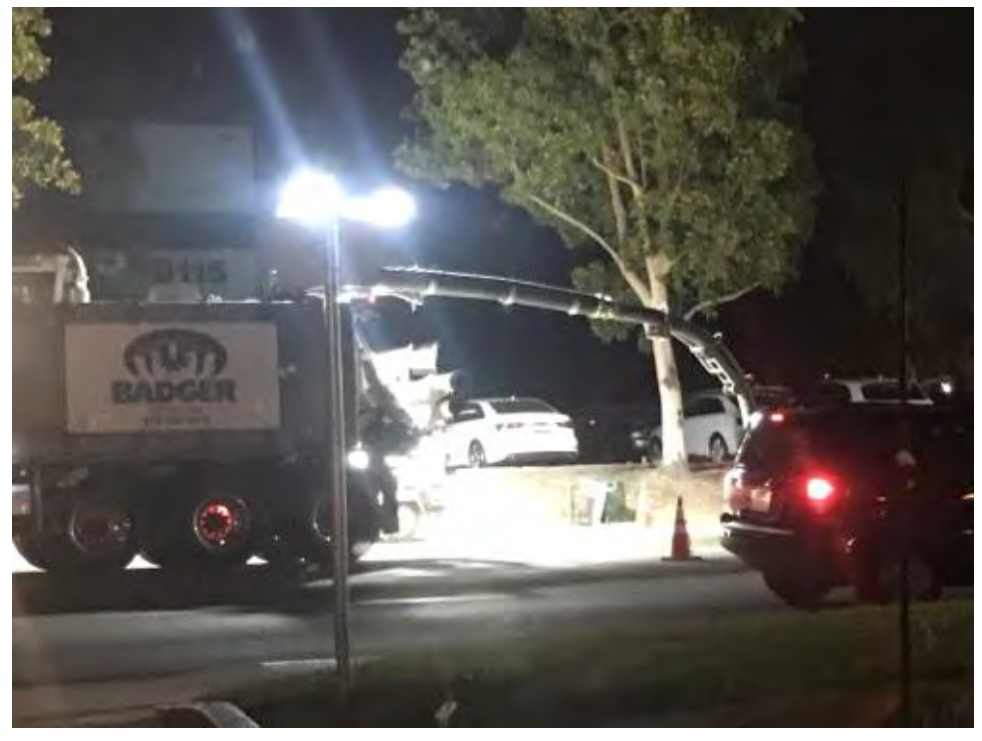
Potholing on Activity Road.