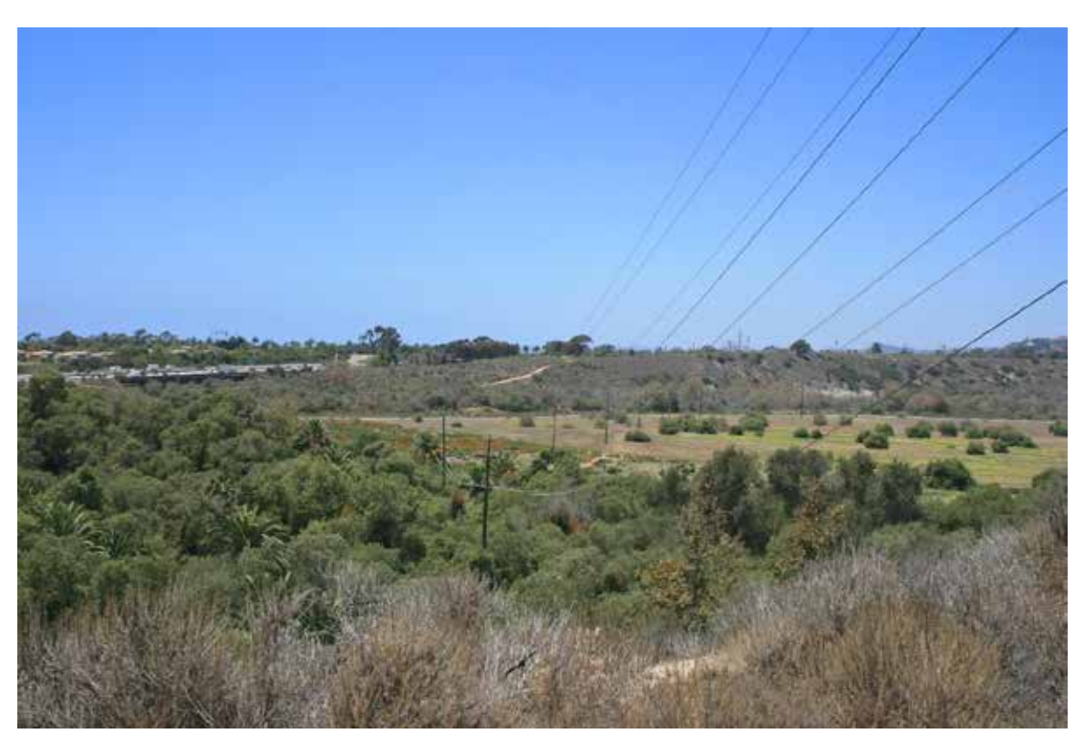
Viewpoint 31: Existing view looking west from the edge of Basilone Road.