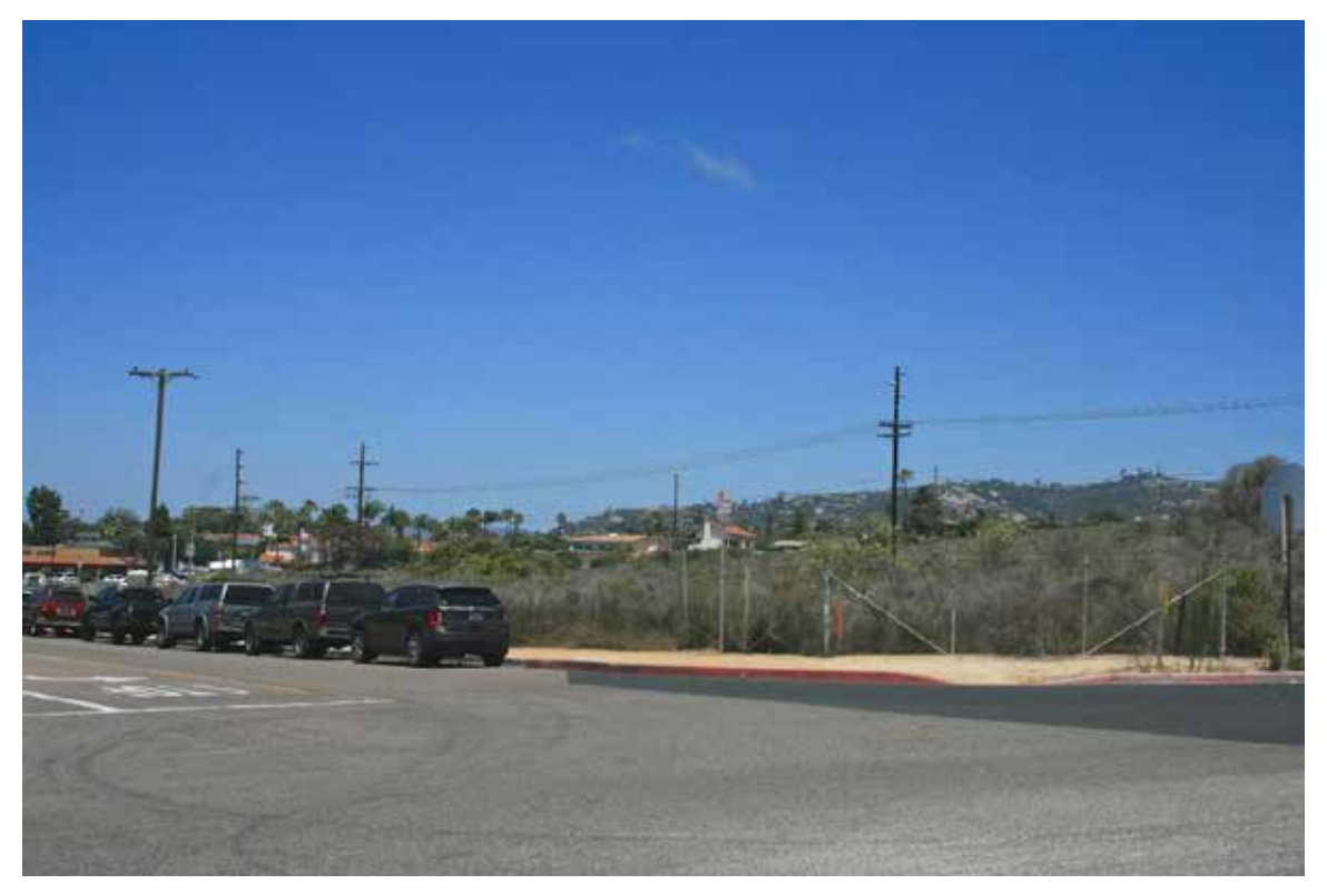
Viewpoint 20: Existing view looking northwest from Cristianitos Road, south El Camino Real.