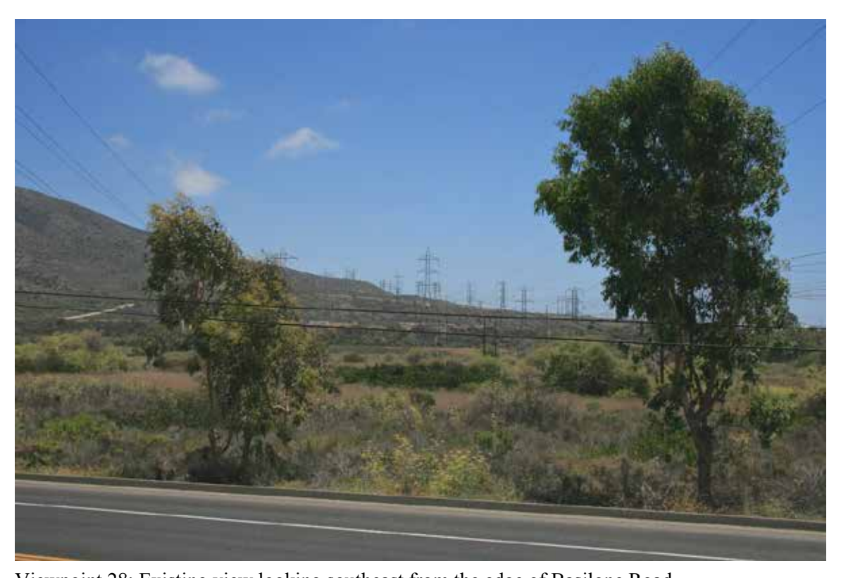
Viewpoint 28: Existing view looking southeast from the edge of Basilone Road.