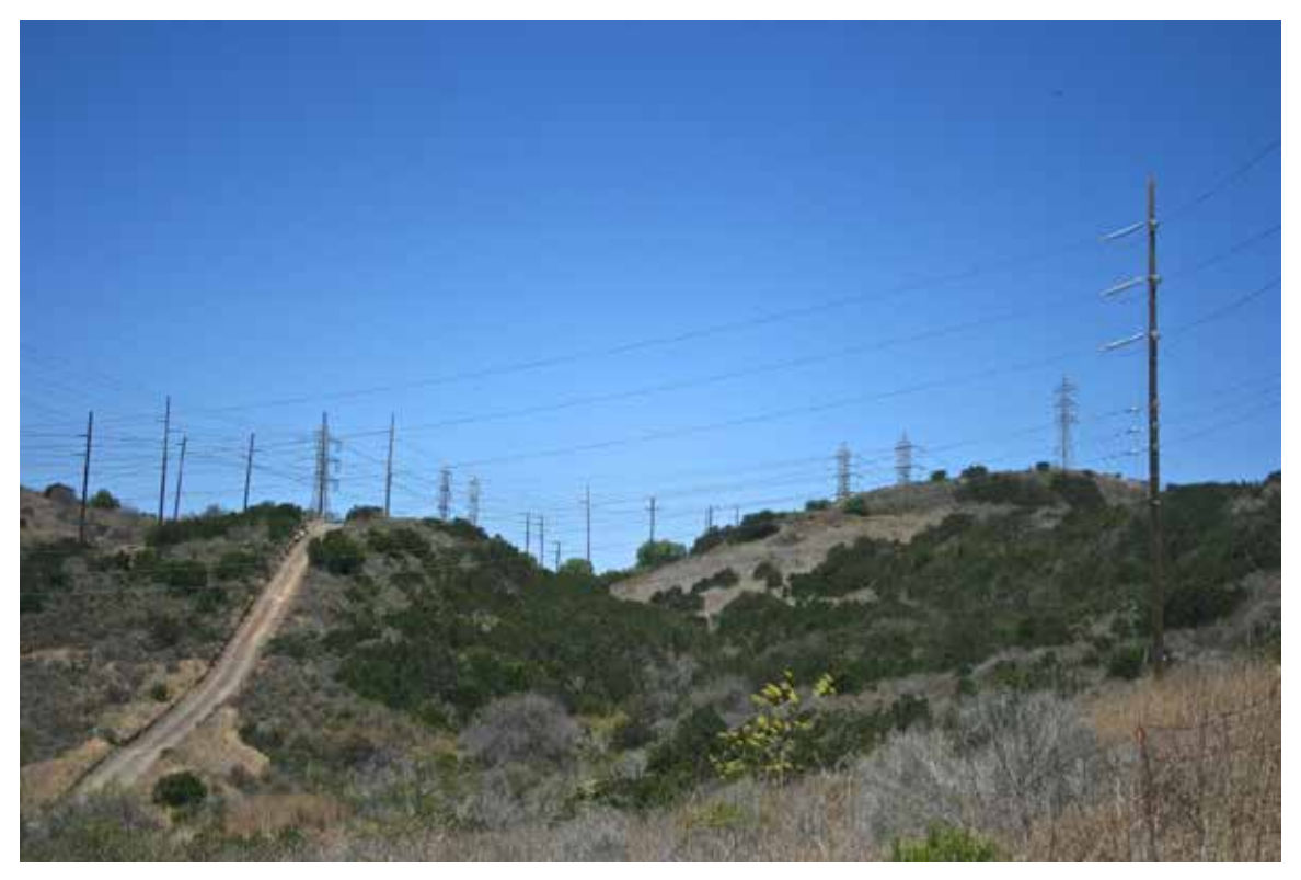
Viewpoint 8: Existing view looking southwest from SDG&E access road at power line.