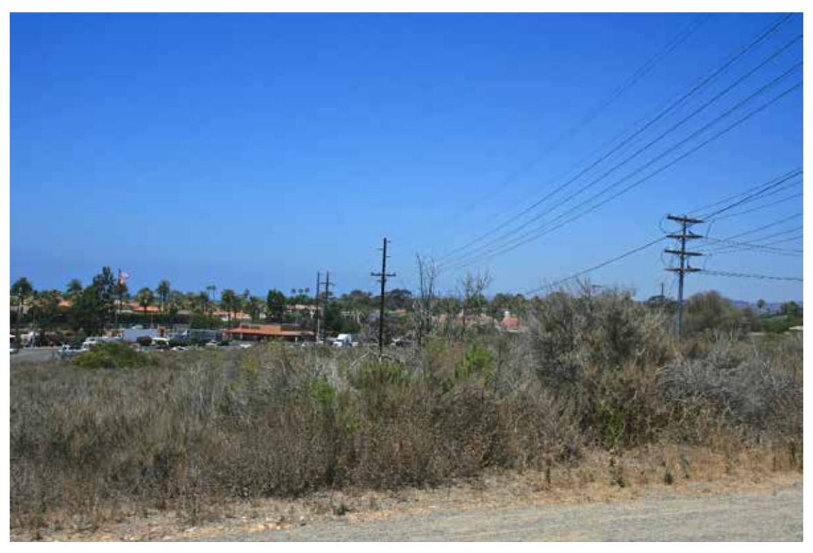
Viewpoint 22: Existing view looking west from Panhe Nature Trail, directly east of Cristianitos Road.