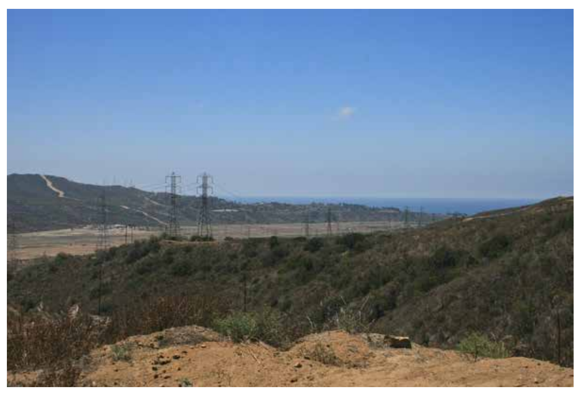
Viewpoint 14: Existing view looking south from SDG&E access road at power line.