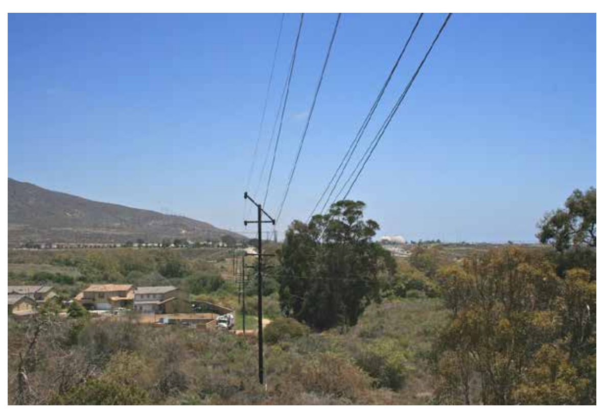
Viewpoint 29: Existing view looking southeast from the edge of Basilone Road.