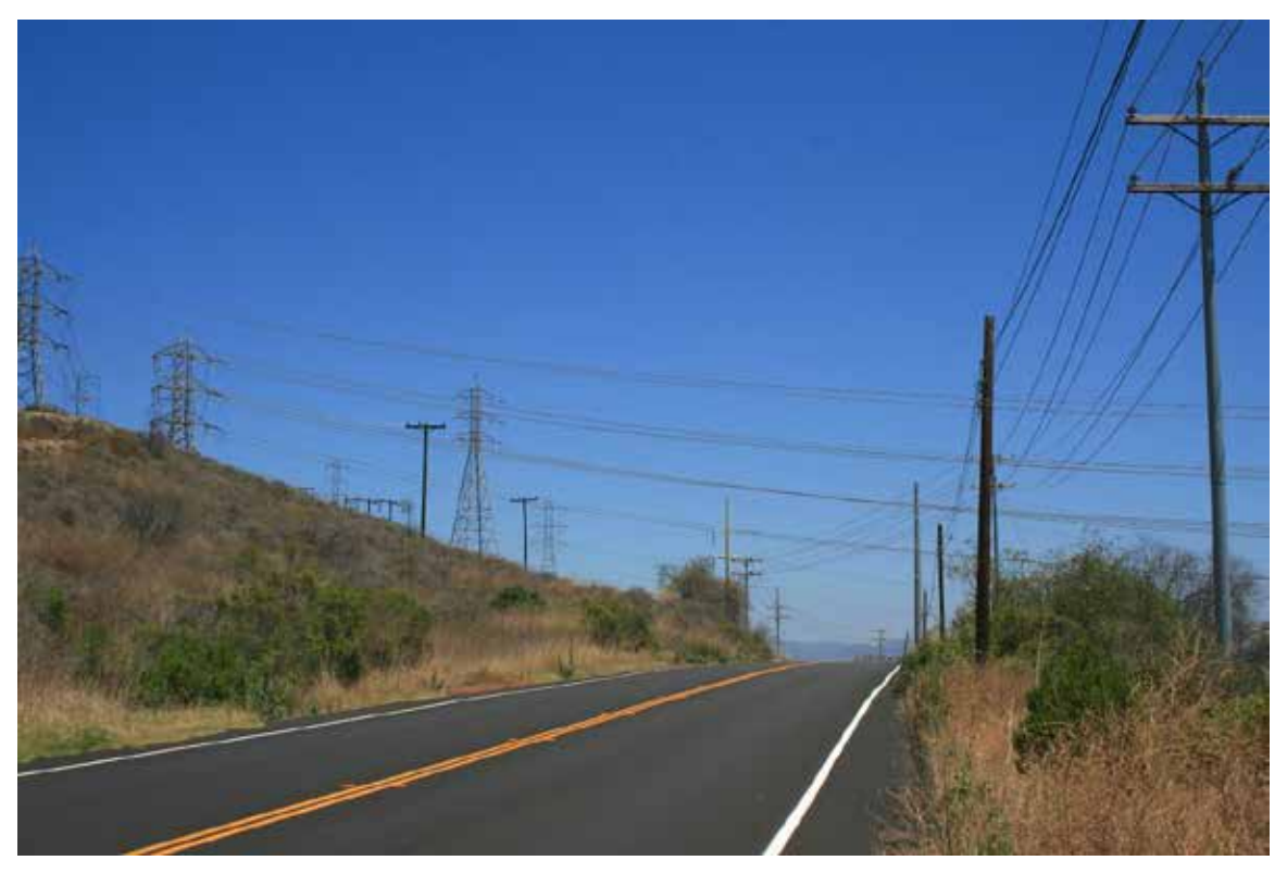
Viewpoint 16: Existing view looking south from Cristianitos Road, north of Viewpoint 15.