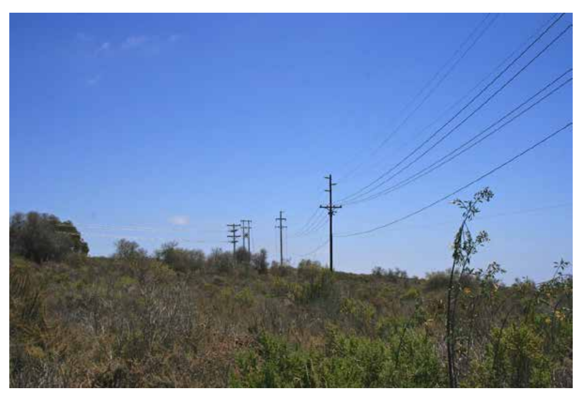
Viewpoint 19: Existing view looking east from Cristianitos Road, east of Carl's Jr. (A simulation of Viewpoint 19 is included in Appendix 4.1-B: Visual Simulations.)