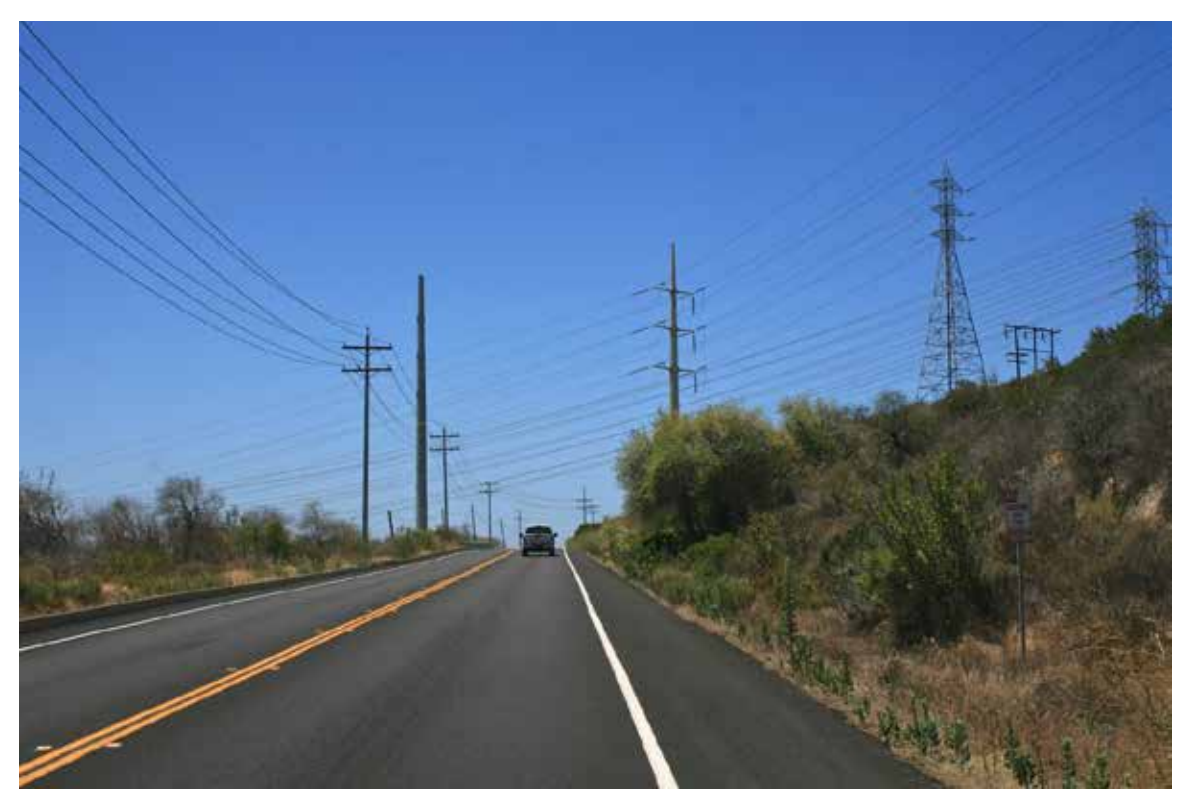
Viewpoint 15: Existing view looking southwest from Cristianitos Road, south of bend in large wash.