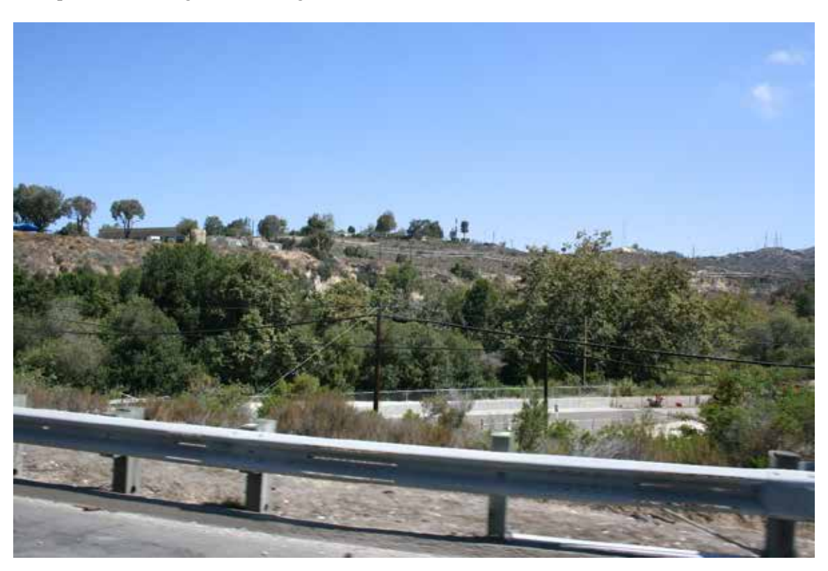
Viewpoint 4: Existing view looking northeast from I-5 northbound, west of canyon at El Camino Real.