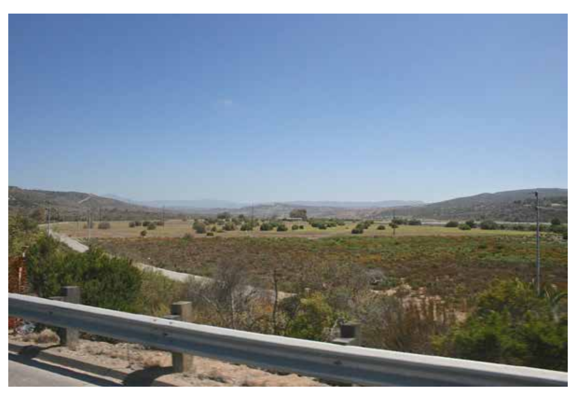
Viewpoint 5: Existing view looking north at creek bed from I-5 northbound, approximately a quarter-mile north of Basilone overcrossing.