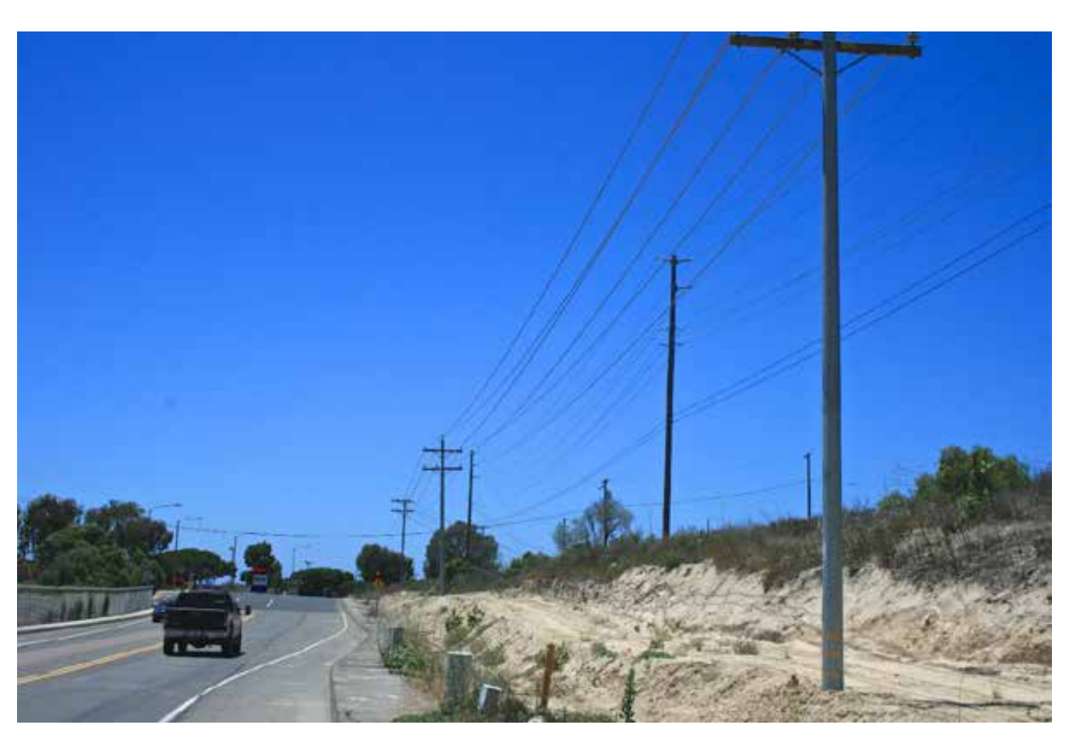
Viewpoint 30: Existing view looking west from the edge of Basilone Road.