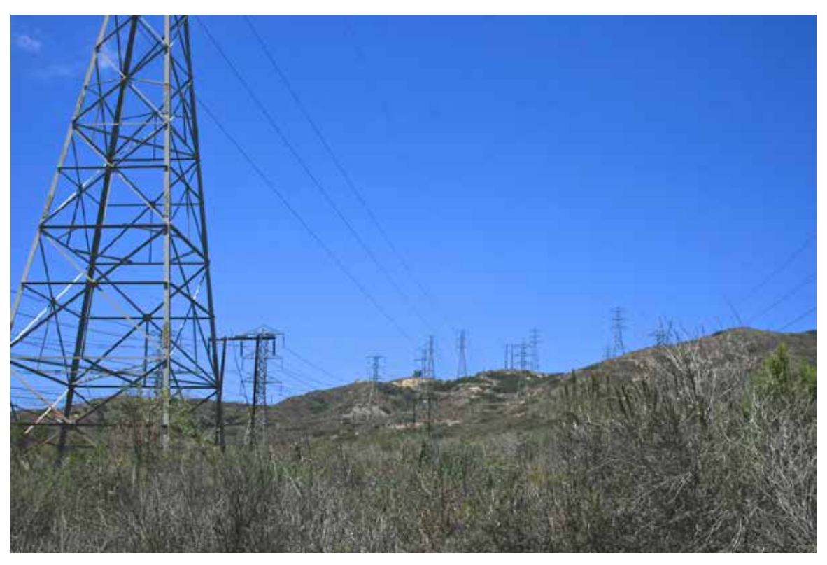
Viewpoint 27: Existing view looking northeast from the edge of Basilone Road.