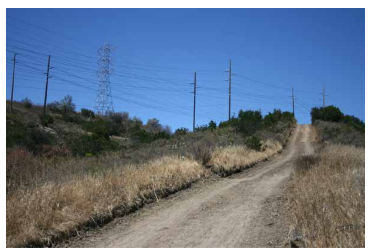
Viewpoint 9: Existing view looking southwest from SDG&E access road at power line. (A simulation of Viewpoint 9 is included in Appendix 4.1-B: Visual Simulations.)