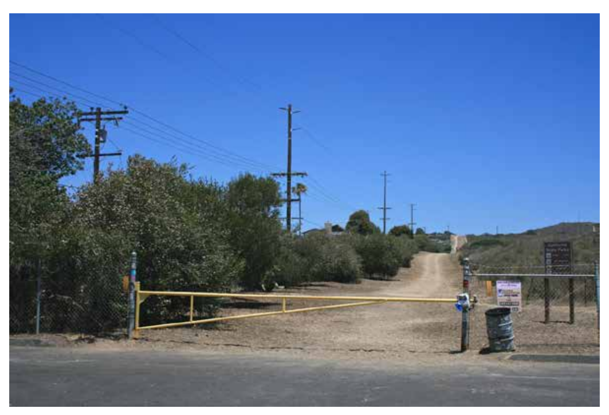
Viewpoint 18: Existing view looking north from Cristianitos Road, east of Carl's Jr. (A simulation of Viewpoint 18 is included in Appendix 4.1-B: Visual Simulations.)