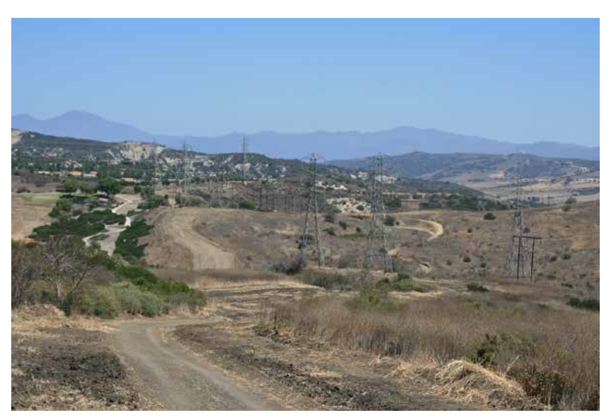
Viewpoint 12: Existing view looking north from SDG&E access road at power line.