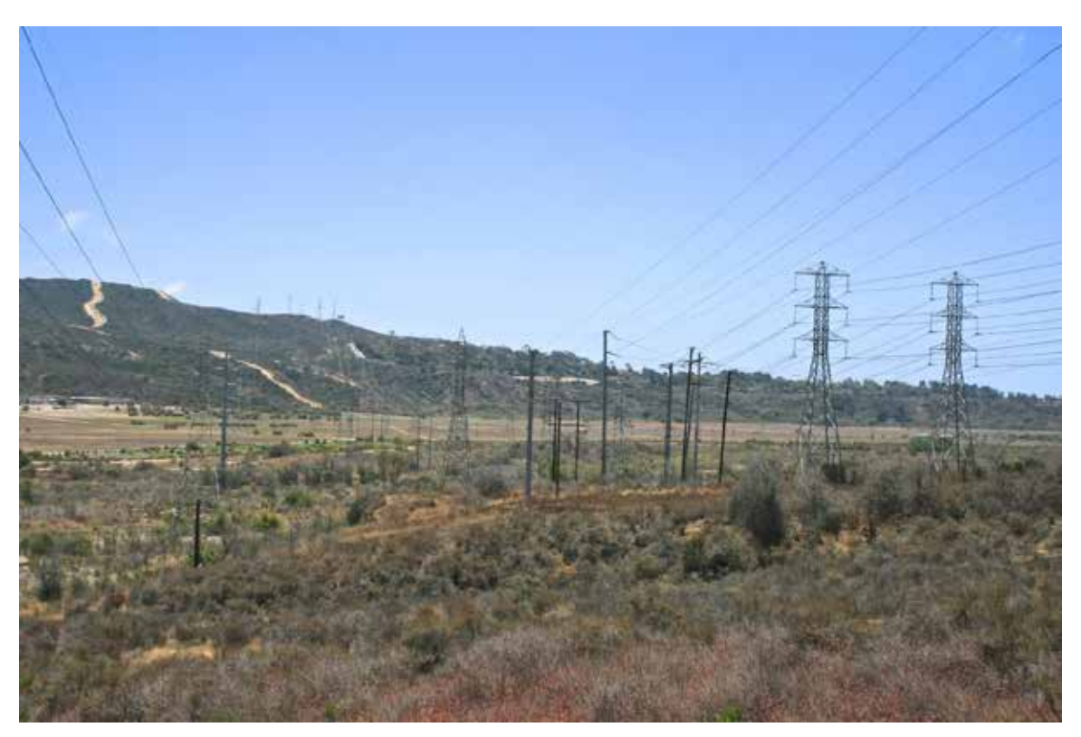
Viewpoint 17: Existing view looking southeast from Cristianitos Road, north of Viewpoint 16.