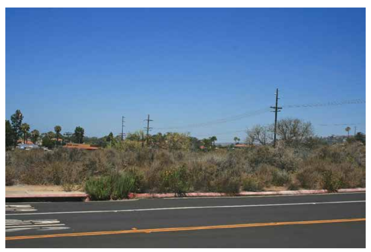
Viewpoint 23: Existing view looking northwest from Cristianitos Road, south of Carl's Jr.