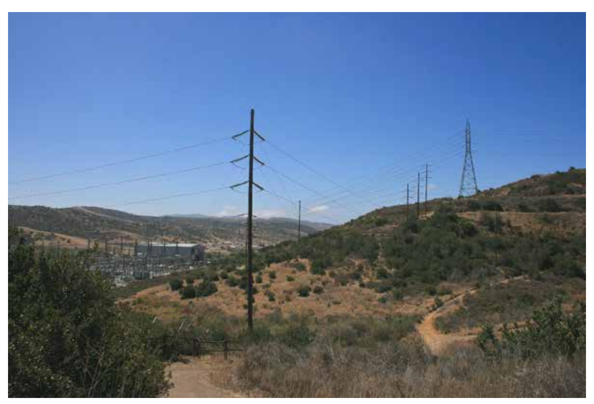
Viewpoint 3: Existing view looking southeast from an SDG&E access road.