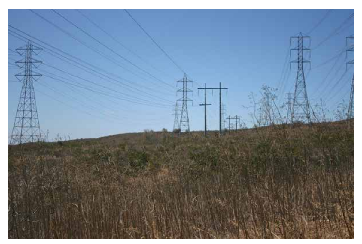
Viewpoint 11: Existing view looking south at from SDG&E access road at power line.