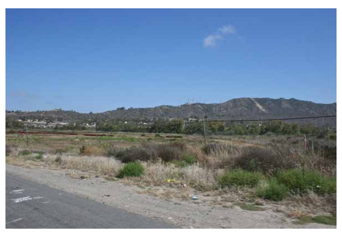
Viewpoint 1: Existing view looking north from Interstate 5 (I-5) northbound, just north of the San Onofre Nuclear Generating Station.