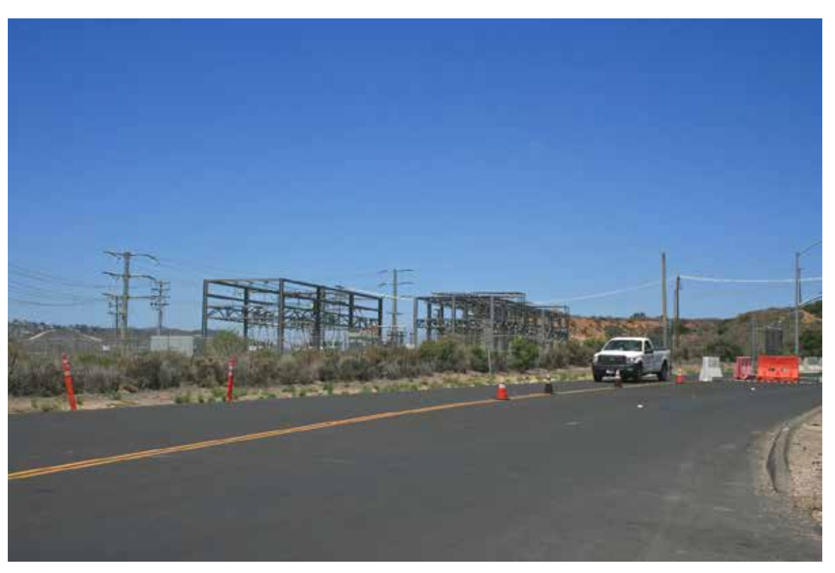
Viewpoint 32: Existing view looking north from Basilone Road, just north of I-5 and south of the MCB Camp Pendleton base access gate.