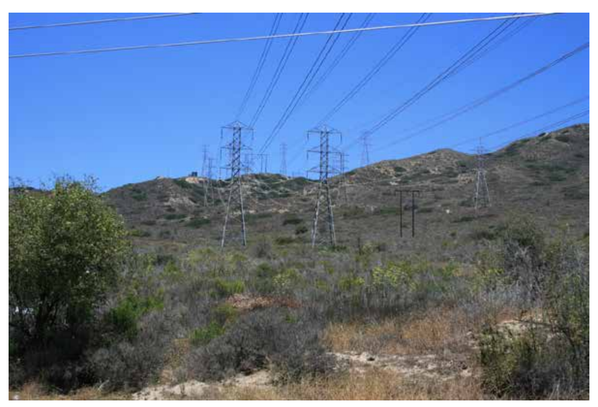
Viewpoint 25: Existing view looking northeast from the edge of Basilone Road.