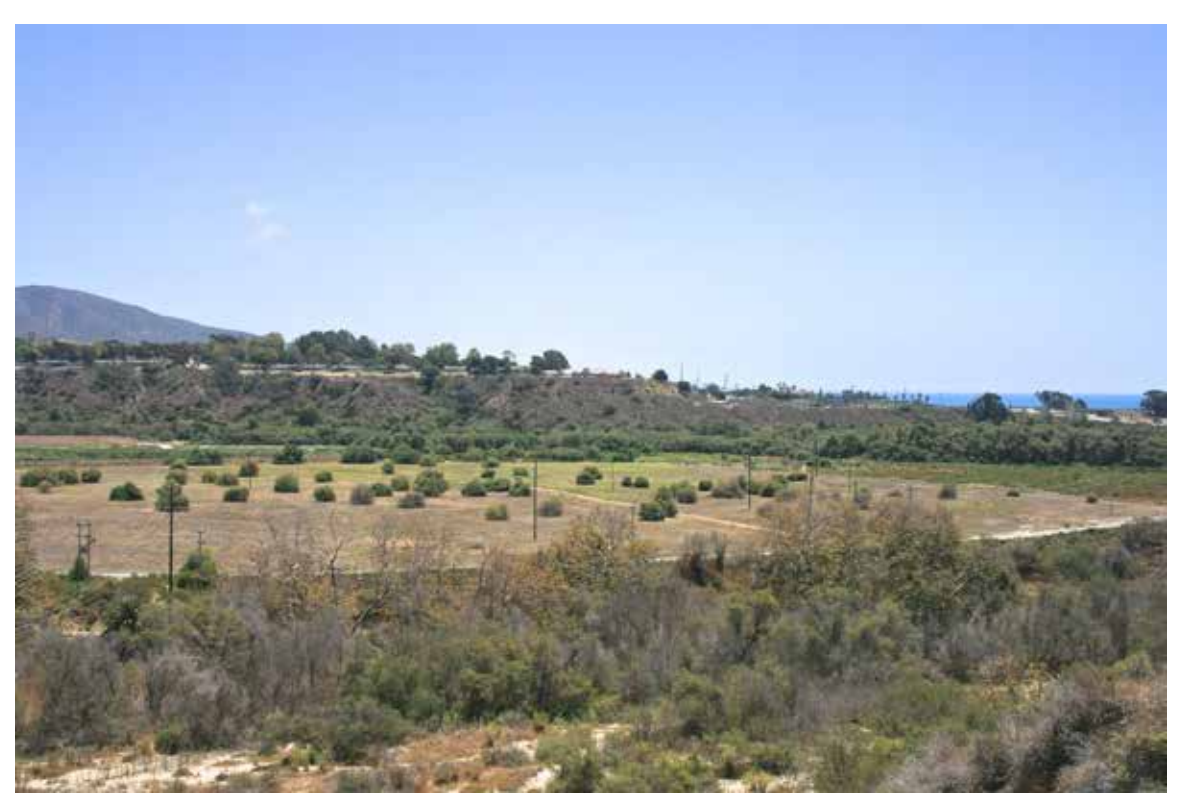
Viewpoint 21: Existing view looking south from Panhe Nature Trail, directly east of Cristianitos Road.