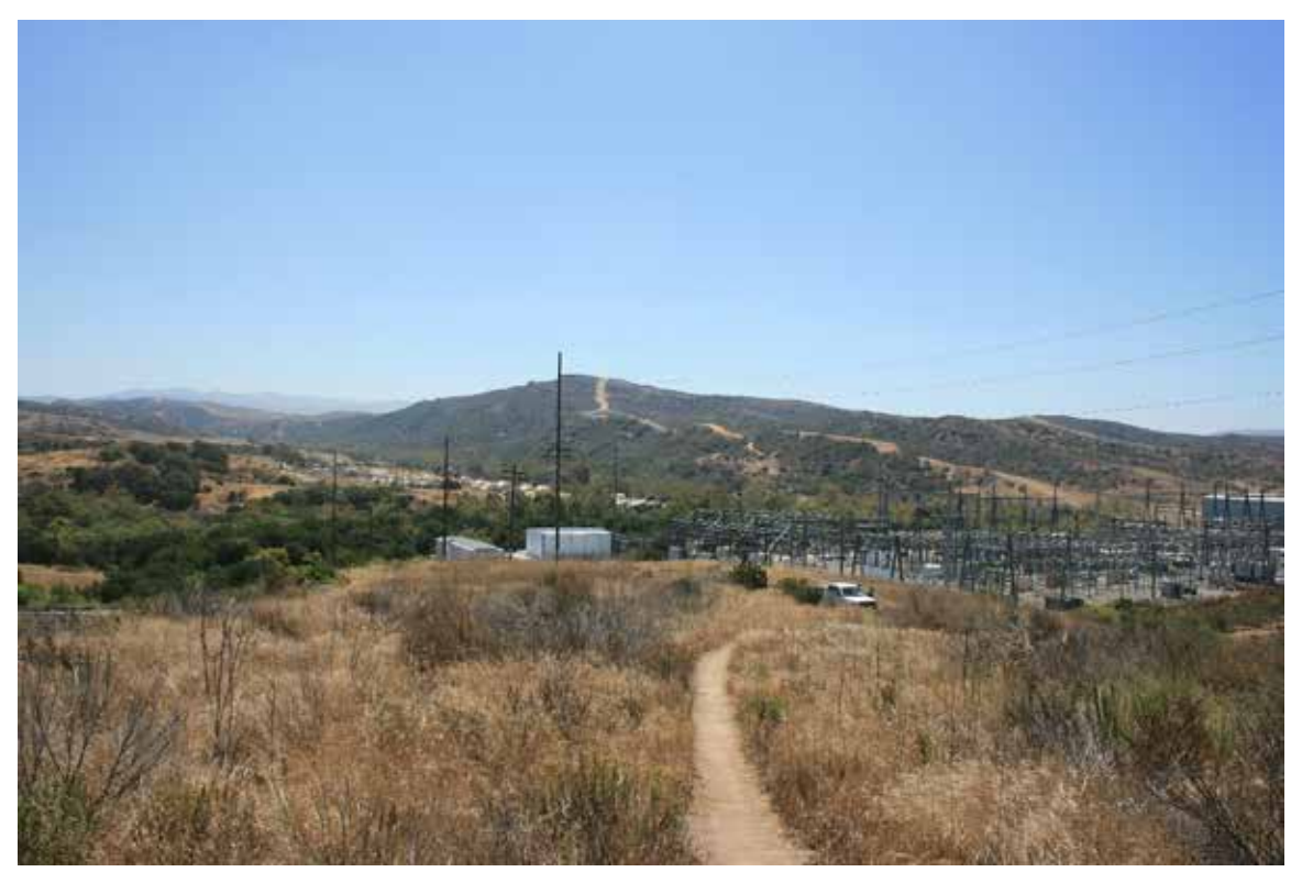
Viewpoint 6: Existing view looking southeast from SDG&E access road at Talega Substation.