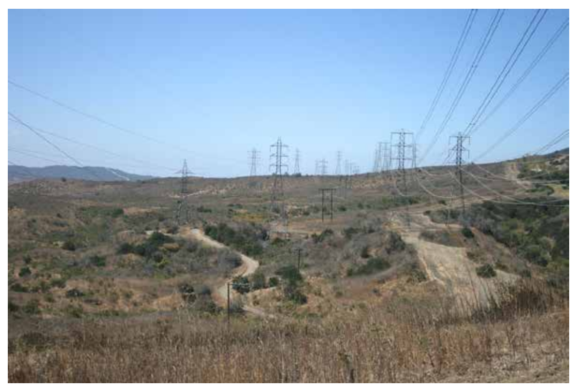
Viewpoint 10: Existing view looking south from SDG&E access road at power line.