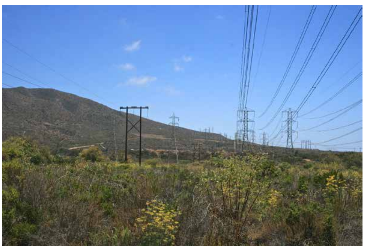
Viewpoint 24: Existing view looking southeast from the edge of Basilone Road at existing lattice tower structure. (A simulation of Viewpoint 24 is included in Appendix 4.1-B: Visual Simulations.)