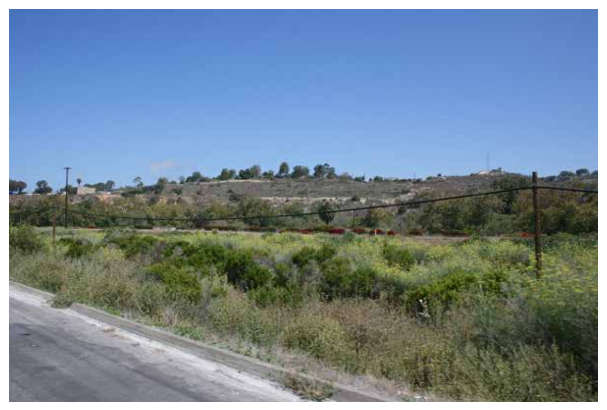
Viewpoint 2: Existing view looking northeast from I-5 northbound, east of El Camino Real.