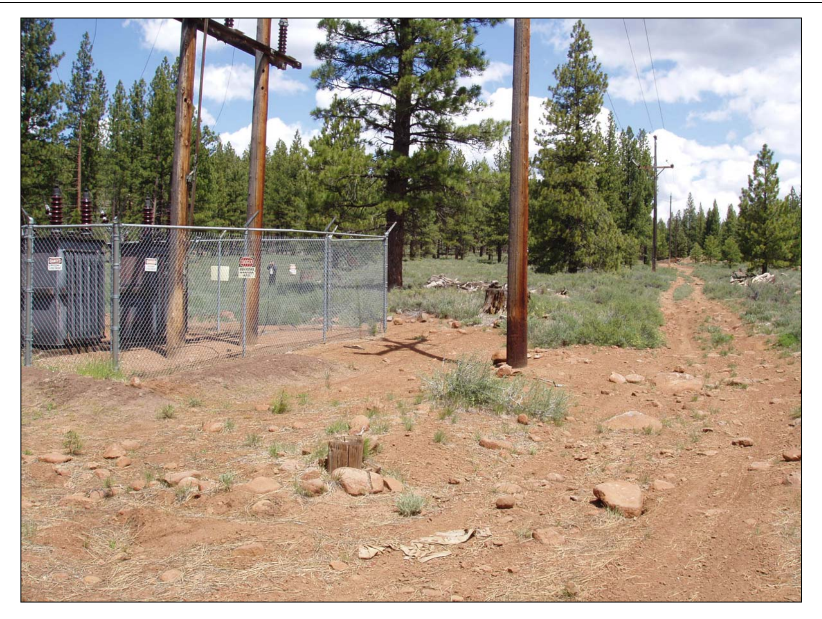
Photo 3: Existing Hobart Substation and access road (looking north)